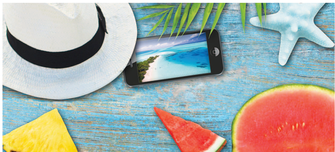
Summer Vacations for Less pg. 13