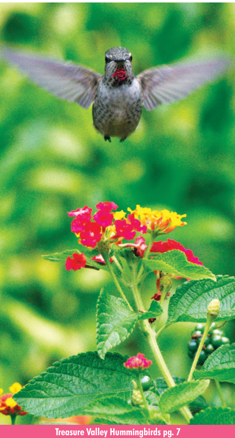
Treasure Valley Hummingbirds pg. 7