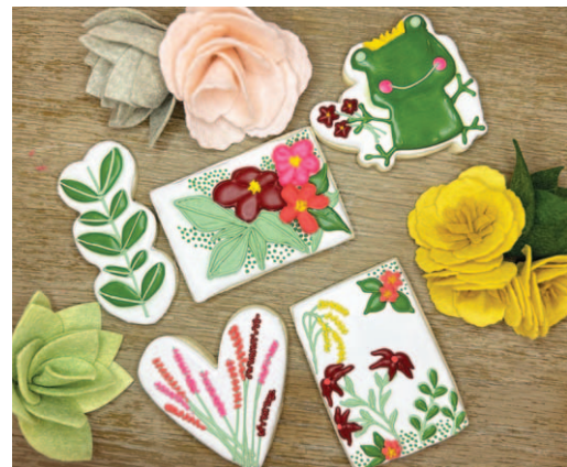
Springtime Cookie Decorating pg. 5