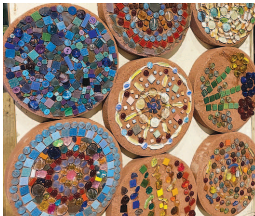
DIY Mosaic Stepping Stones pg. 3