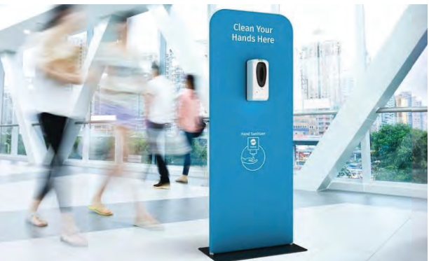
HAND SANITIZER STATIONS