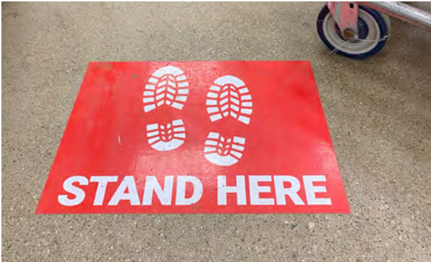
DIRECTIONAL FLOOR DECALS