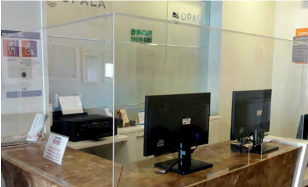
PLEXI SHIELD DIVIDERS