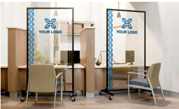
ROLLING GERM SHIELDS