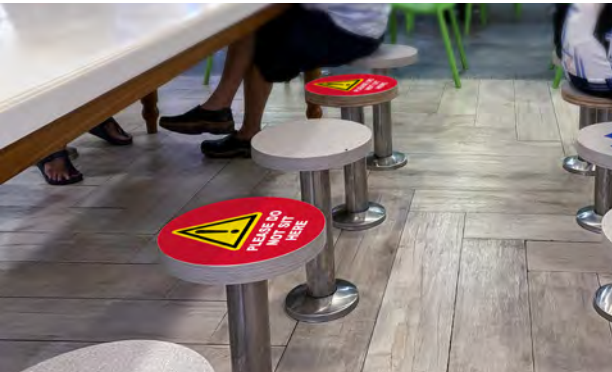
SOCIAL DISTANCING GRAPHICS