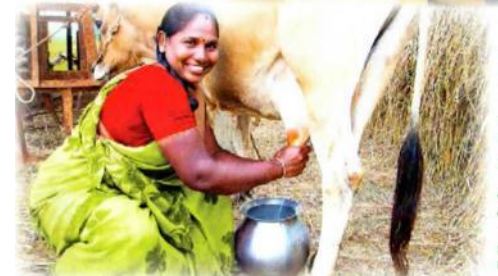
Health & Nutrition