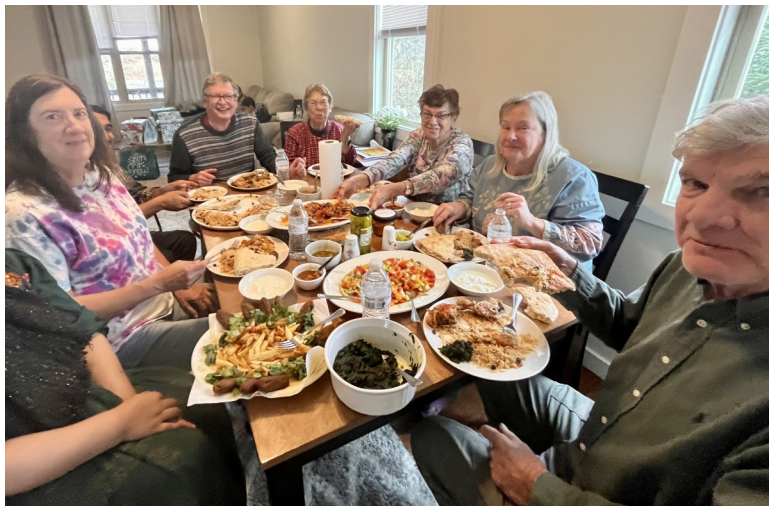
Pictured are the children from the Sarwari Afghan Family and the Circle of Welcome team enjoying a homecooked meal while delivering Christmas Presents!