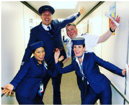
Porter Airlines flight crews consider MLB as one of their favorite destinations to fly into.

The day after Porter Airlines completed its second season, MLB immediately began construction to update the 40,000 square foot customs facility, also known as an FIS (Federal Inspection Station).