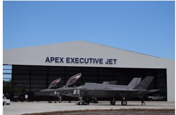
Apex was home of the F-35 Heritage Team and U.S.A.F. Thunderbirds during the 2017 MLB Air Show.