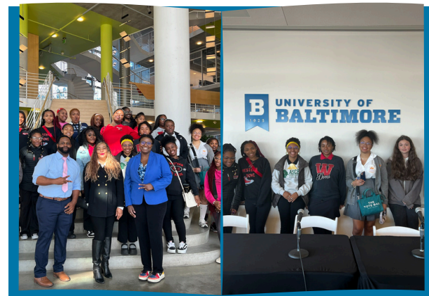
CFCC & UBALT Law hosting Western High and Baltimore Leadership School for Young Women.