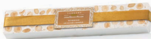
6. SB123 Soft Almond & Pistacchio Torrone 150 g $9.25/12 ea/$111.00