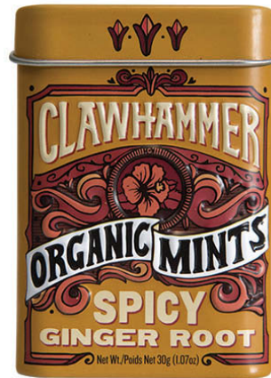
3. BS19038 Spicy Ginger Root