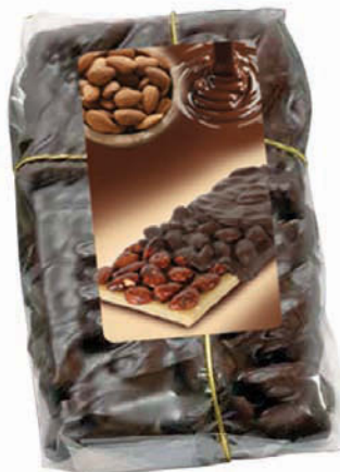
5. SC591 Mandorlato Bar Whole toasted and caramelized almonds with almond paste covered in extra dark chocolate 250 g/8.8 oz $12.75/6 ea/$76.50