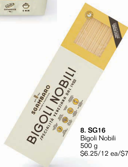
8. SG16 Bigoli Nobili 500 g $6.25/12 ea/$75.00