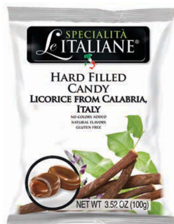
6. SP34 Calabria Licorice Extract Filled Candies 100 g $2.25/12 ea/$27.00