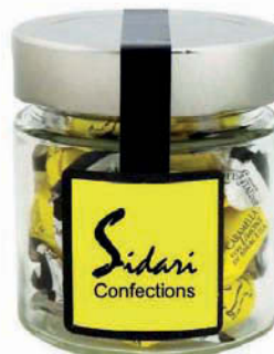
9. PR2215 Lemon Filled Candy Jar 3.0 oz $2.75/12 ea./$33.00