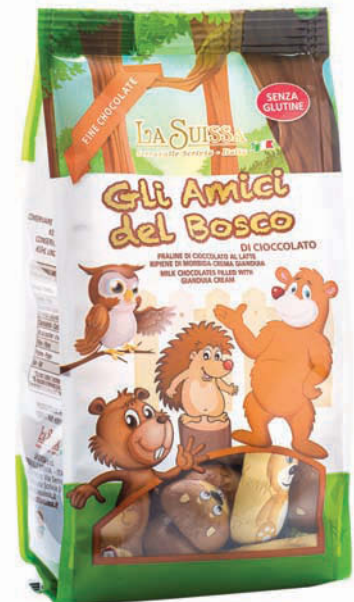
6. LS23905 Forest Friends Chocolate w/Giandua filling 180 g $6.00/12 ea/$72.00