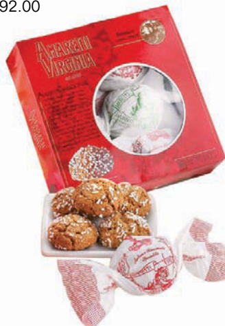
2. AV18-63 Traditional Crunchy Amaretti Gluten-free 150 g $7.25/12 ea/$87.00