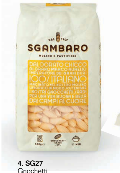
4. SG27 Gnocchetti 500 g $3.50/16 ea/$56.00