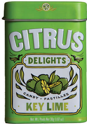
2. BS19046 Key Lime