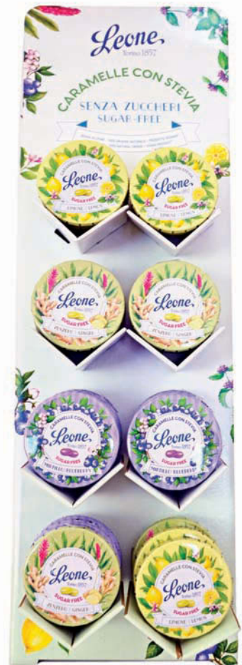
8. LE2535 Blueberry, Lemon & Ginger Stevia Candy Tins 30 g $4.25/24 ea/$102.00