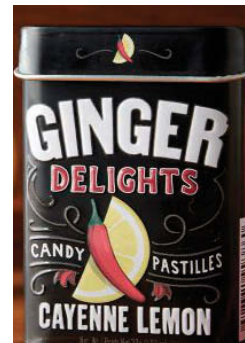
8. BS99388 Cayenne Lemon