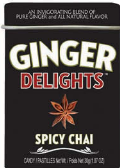
5. BS19020 Spicy Chai

For all flavors: Singles 30 g $2.05/12 ea/$24.60