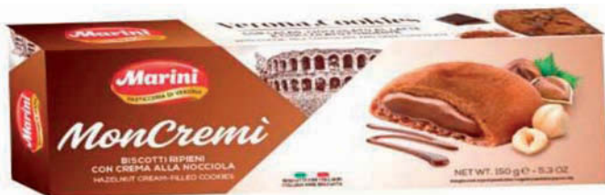
6. MR2373 Biscuit with Hazelnut Cream Filling 150 g $2.75/14 ea/$38.50