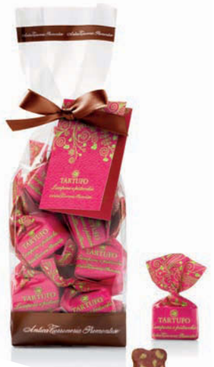
9. PR9918 5.5 oz Raspberry & Pistachio bag $11.50/12 ea/$138.00