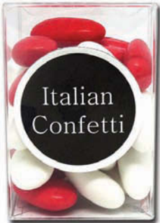
1. PRFC181 Red & White

1-5 Confetti Sugar Coated Almonds Clear Box 2" x 3" x 2" 4.1 oz $4.50/12 ea/$54.00