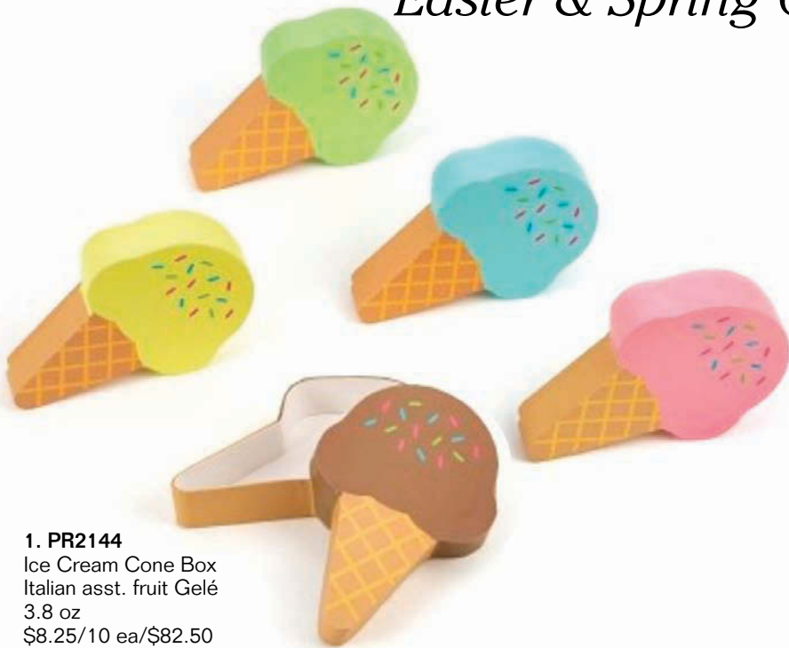
1. PR2144 Ice Cream Cone Box Italian asst. fruit Gelé 3.8 oz $8.25/10 ea/$82.50 5-7/8" x 3-3/4" x 1-1/8"