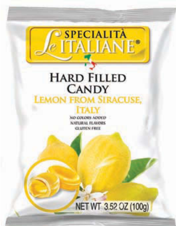
2. SP42 Siracusa Lemon Filled Candies 100 g $2.25/12 ea/$27.00