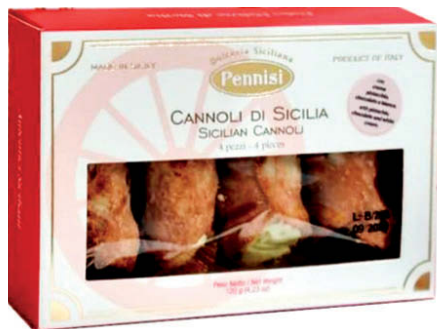
7. PN2442 Assorted Cannoli Box 120 g $5.35/12 ea/$64.20