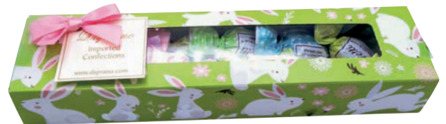
4. PR2296 Bunny Window Gift Box Italian chocolate Ovetto eggs 3.0 oz $6.50/12 ea/$78.00 8-3/4" x 1-7/8" x 1-3/16"