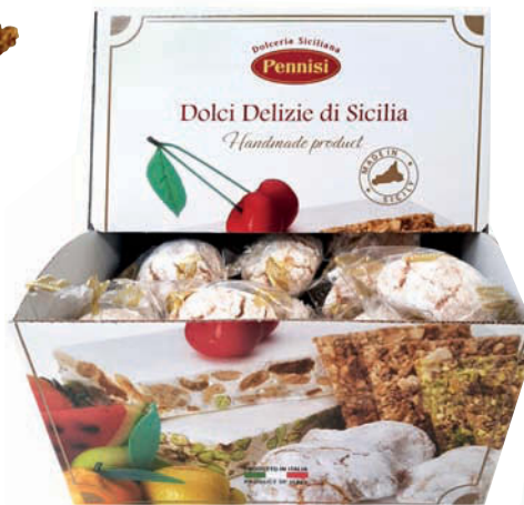
9. PN4224 Assorted Almond Biscuit Display Classic almond, orange, and lemon cookies 3.3 lbs 50 pcs $48.00/1 Display/$48.00