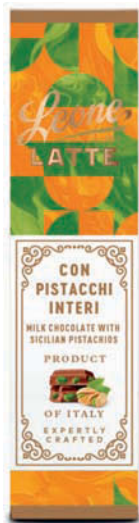
6. LE4302 Milk Chocolate Bar w/pistachio 55 g $4.85/14 ea/$67.90