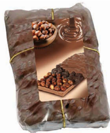
6. SC593 Nocciolato Bar Whole toasted and caramelized hazelnuts with hazelnut paste covered in extra dark chocolate and milk chocolate 250 g/8.8 oz $12.75/6 ea/$76.50