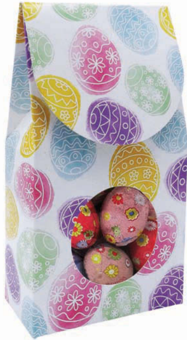
1. PR2117 Egg Ballot Italian milk chocolate eggs w/cocoa cereal 4.5 oz $8.50/12 ea/$102.00 3-1/2" x 6-1/2" x 1-3/4"