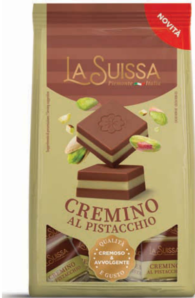
1. LS2120 Milk Cremino w/pistachio 130 g $6.00/12 ea/$72.00