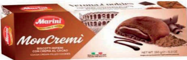
5. MR2380 Biscuit with Chocolate Cream Filling 150 g $2.75/14 ea/$38.50