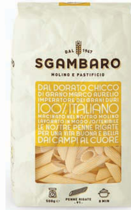
3. SG91 Penne Rigate 500 g $3.50/16 ea/$56.00