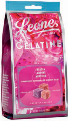
1. LE2857 Wild Berry Jellies 150 g $8.50/6 ea/$51.00