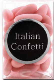
2. PRFC175 Pink