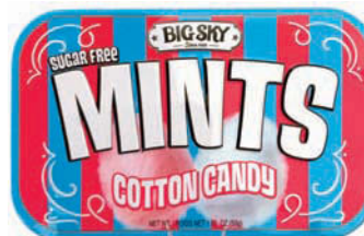
10. BS14811 Cotton Candy Sugar Free