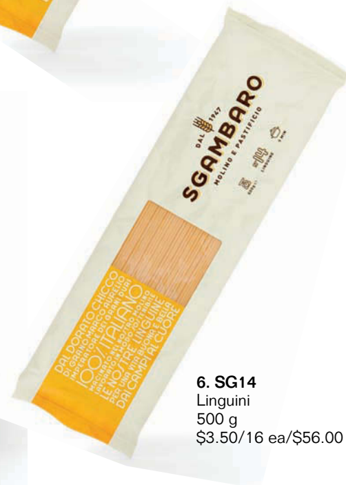
6. SG14 Linguini 500 g $3.50/16 ea/$56.00