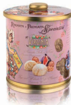
9. AV22-218 Biscuit Tin Almond, fig, walnut soft cookies 220 g $23.00/6 ea/$138.00