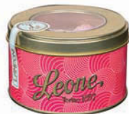
7. LE2773 Raspberries candies in round window tins 150 g $7.50/12 ea/$90.00