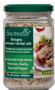
7. SD0003 Seasonello Aromatic Herbal Salt 10.58 oz $4.00/6 ea/$24.00