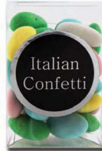
4. PRFC140 Pastel