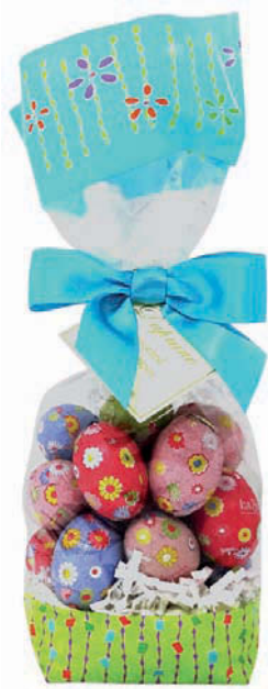
1. PR2220 Flower Foil Chocolate Eggs in Gift Bag Italian chocolate 6.0 oz $7.25/12 ea/$87.00 2-1/2" x 7" x 2"