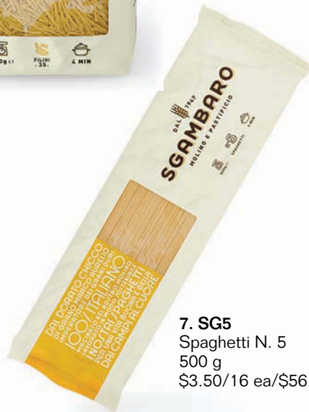
7. SG5 Spaghetti N. 5 500 g $3.50/16 ea/$56.00