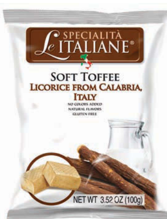
7. SP44 Calabria Licorice Extract Toffees 100 g $2.25/12 ea/$27.00