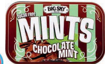
11. BS14815 Chocolate Mint Sugar Free