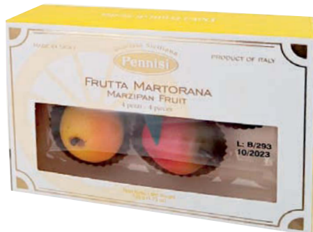
8. PN4200 Assorted Fruit Marzipan 120 g 4 pcs $6.75/12 ea/$81.00