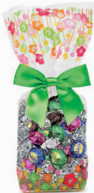
5. PR2110 Spring Flowers Italian milk chocolate w/hazelnuts, cocoa, Amaretto, coffee 4.6 oz $7.25/12 ea/$87.00 2-1/2" x 7" x 2"