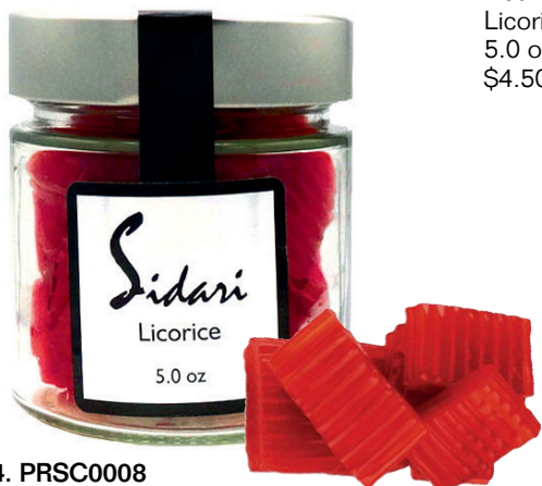
4. PRSC0008 Flat Strawberry Licorice Jar 5.0 oz $4.50/12 ea/$54.00