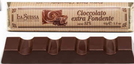
2. LS2002 Dark 52% Bar 45 g $1.70/15 ea/$25.50