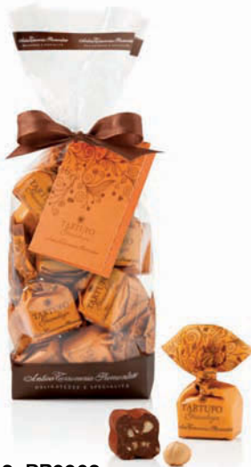
2. PR9902 5.5 oz Gianduia bag $11.00/12 ea/$132.00