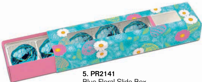
5. PR2141 Blue Floral Slide Box Italian milk chocolate w/cereal filling 1.9 oz $7.25/12 ea/$87.00 8-3/4" x 1-7/8" x 1-3/16"