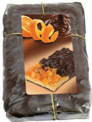
4. SC595 Aranciotto Bar Candied orange peel with orange-almond paste covered in extra dark chocolate 250 g/8.8 oz $12.75/6 ea/$76.50