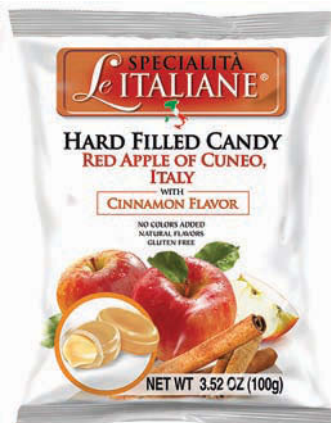
3. SP37 Cuneo Red Apple with a hint of cinnamon Filled Candies 100 g $2.25/12 ea/$27.00