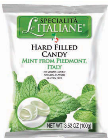
5. SP22 Piedmont Mint Filled Candies 100 g $2.25/12 ea/$27.00