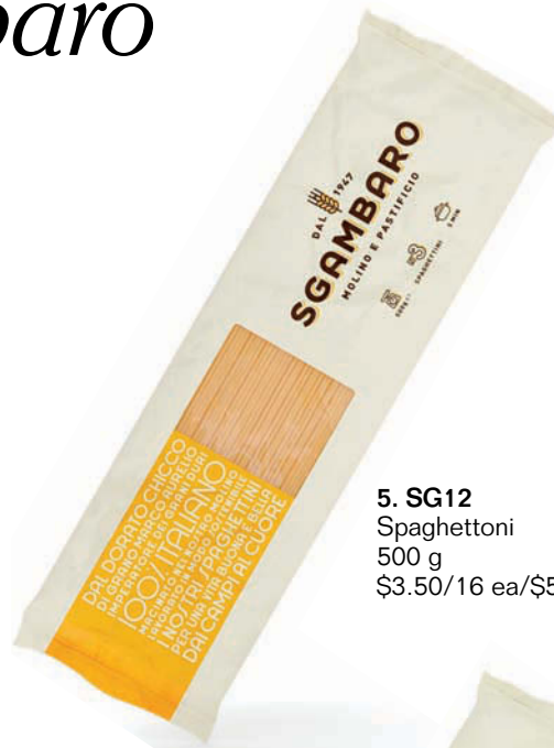
5. SG12 Spghettoni 500 g $3.50/16 ea/$56.00