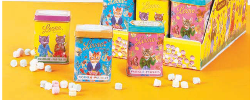
3. LE1282 Nathalie Lete Tins 45 g $4.95/18 ea/$89.10