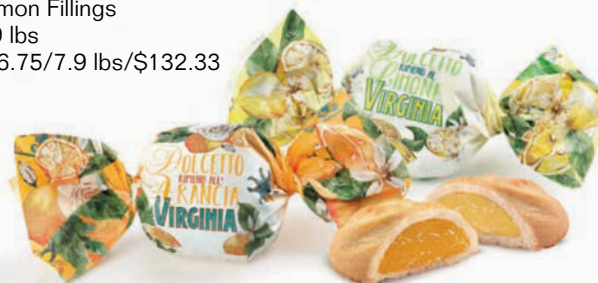
4. AV28-48 Pastry w/ Orange and Lemon Fillings 7.9 lbs $16.75/7.9 lbs/$132.33