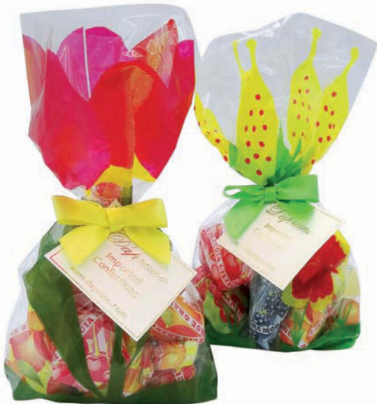
4. PR2115 Spring Flowers Italian assorted fruit candy 3.5 oz $3.25/6 ea/$19.50 3-1/2" x 5-1/2" x 2"