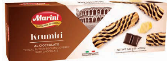
2. MR2441 Classic Biscuit with Chocolate 140 g $3.50/14 ea/$49.00