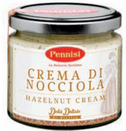
4. PN5740 Hazelnut Cream 190 g $7.00/12 ea/$84.00