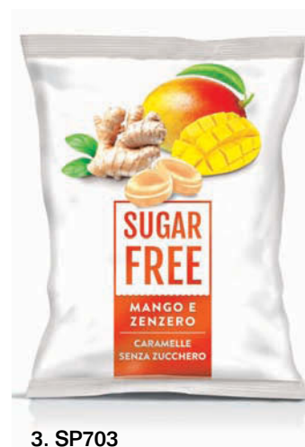
3. SP703 Mango, Ginger Sugar Free 80 g