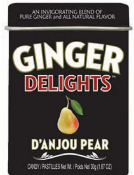
9. BS19018 D'Anjou Pear

For all flavors: Singles 40 g $2.35/6 ea/$14.10