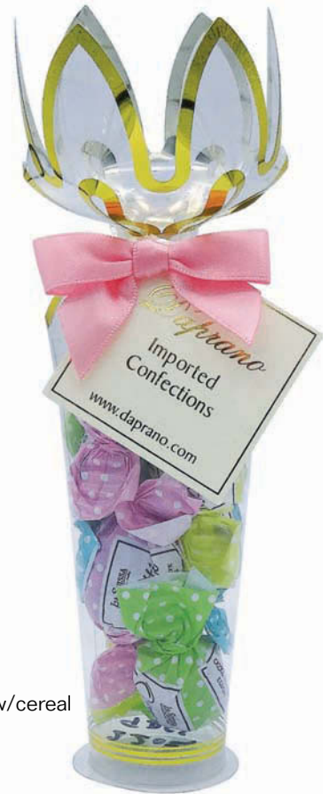
3. PR2134 Spring Coronet Italian milk chocolate w/cereal 2.2 oz $4.50/12 ea/$54.00 2-1/2" x 7" x 2-1/2"