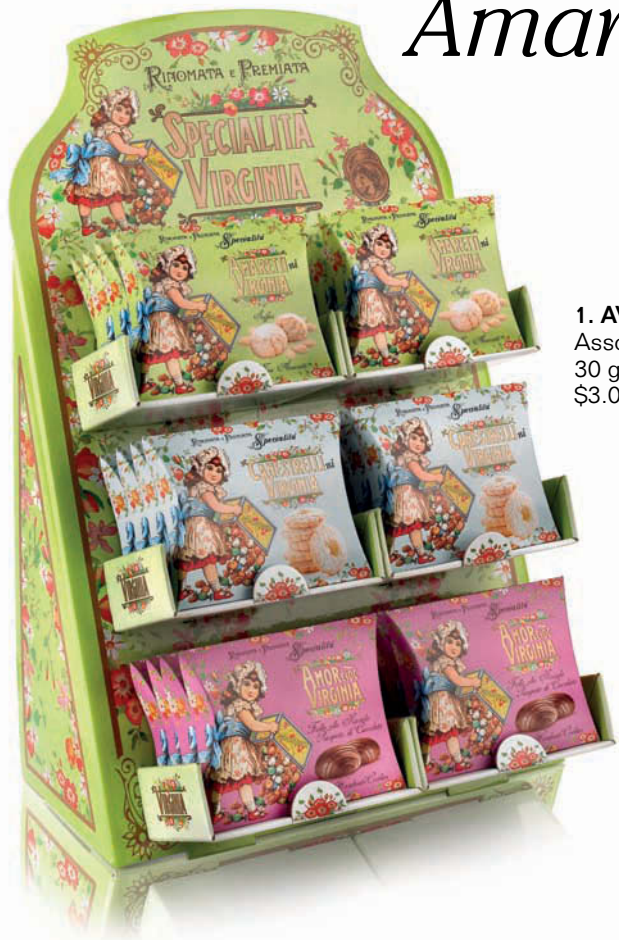
1. AV21-319 Assorted Biscuit Display 30 g $3.00/48 ea/$144.00