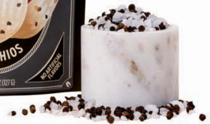
2. JN6013 Salt & Pepper Pistachios 4.5 oz $6.75/6 ea/$40,50