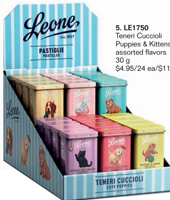
5. LE1750 Teneri Cuccioli Puppies & Kittens Tins Display assorted flavors 30 g $4.95/24 ea/$118.80