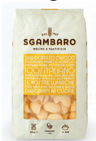
2. SG53 Lumache 500 g $3.50/16 ea/$56.00