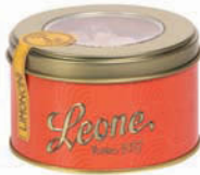
4. LE2774 Lemon Tin and Blood Orange Tins lemon and blood orange fruit jelly 150 g $7.50/12 ea/$90.00