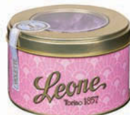
5. LE2771 Violets candies in round window tin 150 g $7.50/12 ea/$90.00