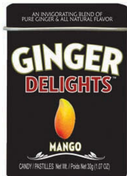
6. BS19019 Mango