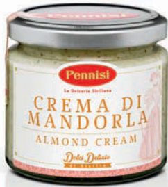
2. PN5726 Almond Cream 190 g $7.00/12 ea/$84.00