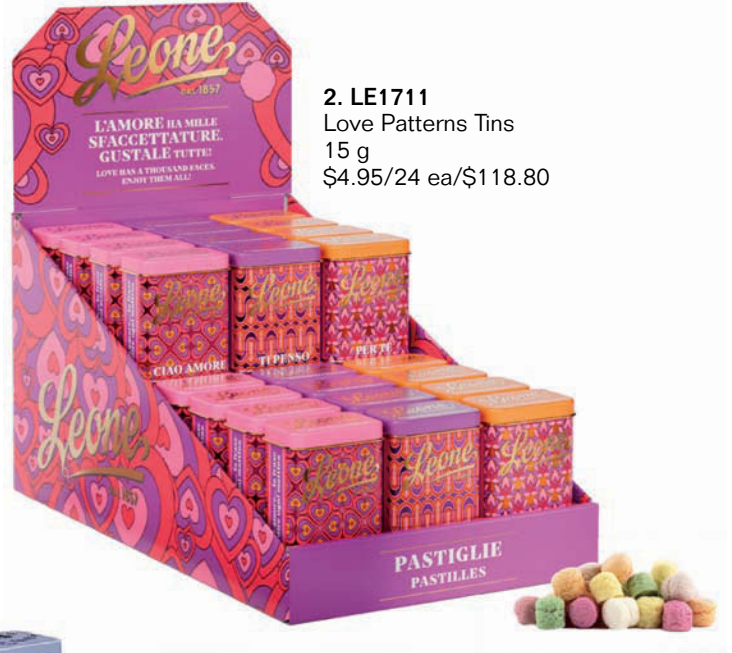
2. LE1711 Love Patterns Tins 15 g $4.95/24 ea/$118.80