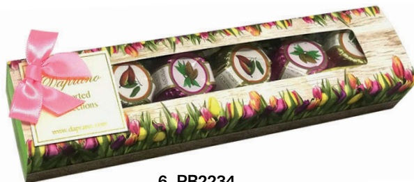
6. PR2234 Blooming Tulips Window Gift Box Italian milk chocolates w/cereal center 2.6 oz $6.50/12 ea/$78.00 8-3/4" x 1-7/8" x 1-3/16"