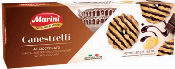
1. MR2427 Biscuit with Chocolate 120 g $3.50/14 ea/$49.00

The key to our development starts from the quality of our made in Italy specialities, based on simple recipes created with quality natural ingredients, without additives and colourings, skillfully crafted with the mastery and experience of the pastry art of our Verona area.