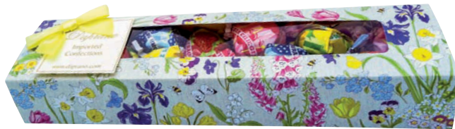
3. PR2133 Flower Window Gift Box Italian asst. fruit candy 3.4 oz $5.50/12 ea/$66.00 8-3/4" x 1-7/8" x 1-3/16"