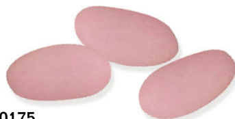
6. F0175 Pink Napoli Almonds $17.50/5 lbs/$87.50 approx. 125 pcs per lb/$0.14 per pc