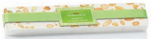
7. SB125 Soft Hazelnut & Almond Torrone 150 g $9.25/12 ea/$111.00