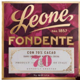
1. LE5009 70% Dark Chocolate 70 g $5.50/18 ea/$99.00