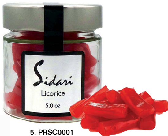
5. PRSC0001 Strawberry Licorice Bites Jar 5.0 oz $4.00/12 ea/$48.00