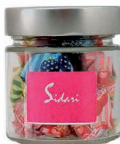
8. PR2207 Italian Candy hard candy with soft center assorted fruits 4.0 oz $2.75/12 ea./$33.00