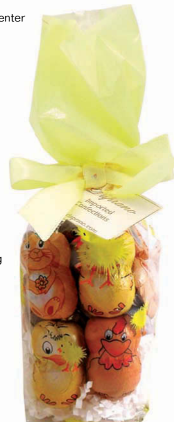
6. PR2233 Happy Farm Chocolates in Chick Bag Italian chocolate 5.5 oz $7.25/12 ea/$87.00 2-1/2" x 7" x 2"