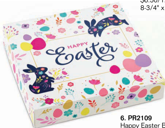
6. PR2109 Happy Easter Box filled with Italian fruit gelés 5.0 oz $6.75/12 ea/$81.00 5-3/4" x 5-3/4" x 1"