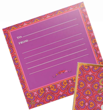
3. LE4243 Milk Chocolate Love Card 70 g $7.50/16 ea/$120.00