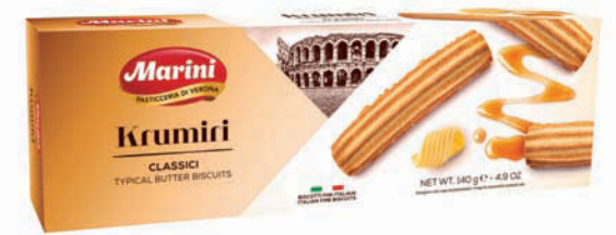
4. MR2434 Classic Butter Biscuit 140 g $3.00/14 ea/$42.00