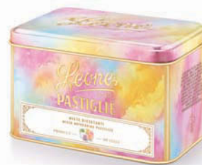
3. LE3570 Mixed Pastilles Gift Box $15.00/6 ea/$90.00