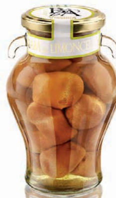
6. AV41-03 Baba al Limoncello bite-size cake in limoncello syrup 520 g $24.00/6 ea/$144.00