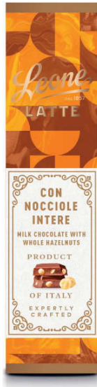
5. LE4301 Milk Chocolate Bar w/hazelnut 55 g $4.85/14 ea/$67.90