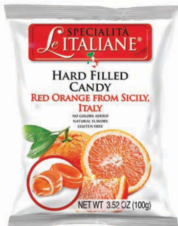
1. SP41 Sicilian Red Orange Filled Candies 100 g $2.25/12 ea/$27.00

Italian candies from Serra. Available in eight refreshing flavors. Gluten Free and made with Natural Flavors and No Artificial Colors.