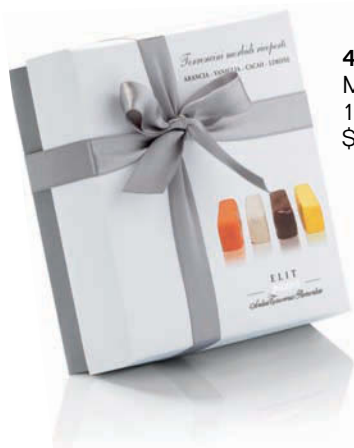
4. SB180 Mixed Nougat Box 125 g $11.25/6 ea/$67.50