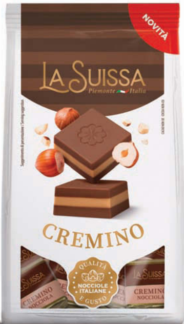
4. LS1120 Milk Cremino w/hazelnut 150 g $6.00/12 ea/$72.00