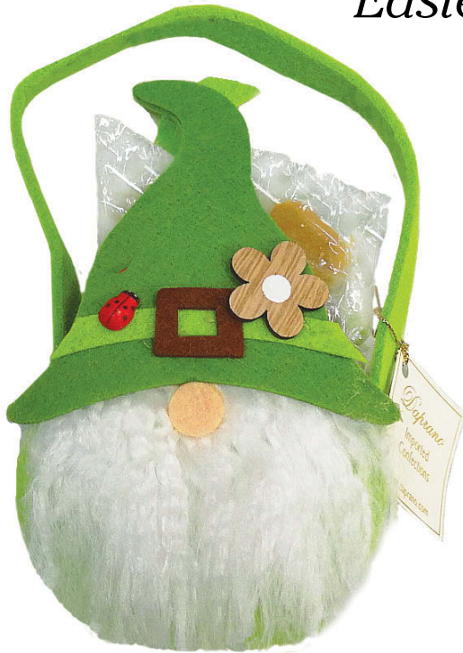
1. PR3179 Spring Gnome Italian Gelé 3.6 oz 11 pcs. 4-1/4" x 6-1/2" x 2-1/2" $5.00/6 ea/$30.00