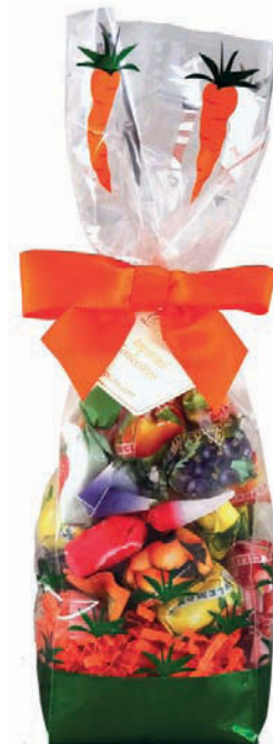
6. PR2200 Carrot Theme Bag Fruit filled Italian hard candy 5.5 oz $4.75/12 ea/$57.00 3" x 9" x 2-1/2"