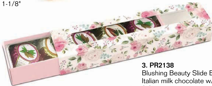
3. PR2138 Blushing Beauty Slide Box Italian milk chocolate w/cereal center 2.6 oz $7.25/12 ea/$87.00 8-3/4" x 1-7/8" x 1-3/16"