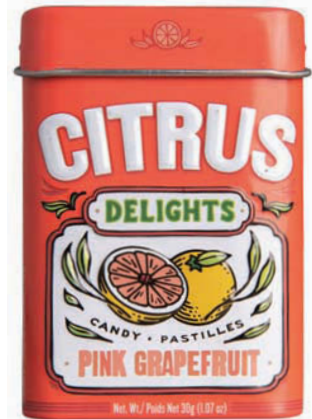
4. BS19079 Pink Grapefruit

For all flavors: Singles 30 g $2.05/12 ea/$24.60