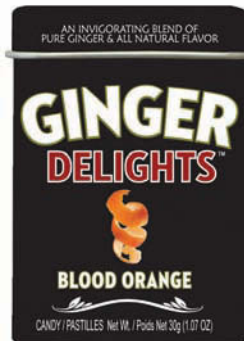
7. BS19021 Blood Orange