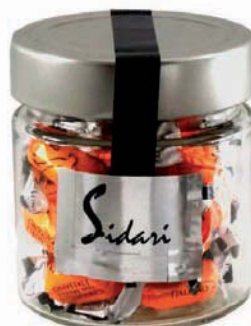
6. PR2213 Honey Filled Candy Jar 3.0 oz $2.75/12 ea./$33.00