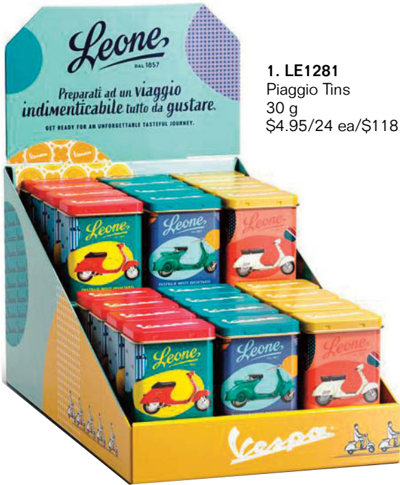
1. LE1281 Piaggio Tins 30 g $4.95/24 ea/$118.80

Leone is one of the oldest confection companies in Italy specializing in fruit pastilles, digestives, and jellies. Beautifully packaged in convenient pocket sizes. More like flavored candies than mints, these tiny digestives come in a small box wrapped in old fashion paper and sealed with a gold sticker.