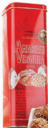
1. AV18-20 Traditional Crunchy Amaretti Tin Gluten Free 175 g $16.00/12 ea/$192.00

Amaretti Virginia, a historical brand born in 1860, a synonym of quality and refinement in the art of making desserts and pastries. It achieved its fame for the production of soft "Amaretti", and nowadays boasts a broad range of exquisite and elegant specialties.