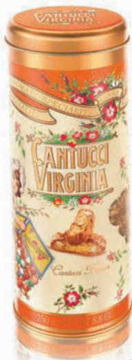
4. AV35-24 Cantucci Tin 250 g $17.50/8 ea/$140.00