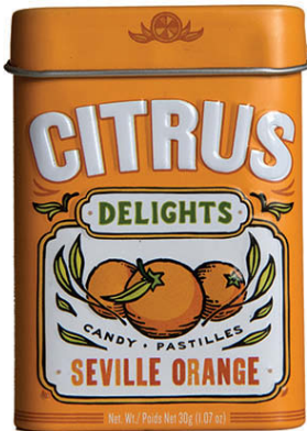
1. BS19047 Seville Orange

For all flavors: Singles 30 g $2.05/12 ea/$24.60