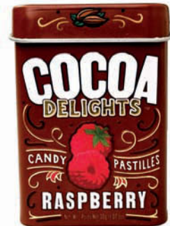
8. BS99384 Raspberry

SUGAR FREE Big Sky Mints For all flavors: $1.95/6 ea/$11.70