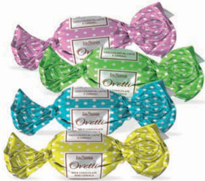
5. LS25643 Milk chocolate with cereal filling $12.50/13.2 lbs/$165.00