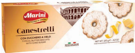
3. MR2410 Butter Biscuit with Powder Sugar 120 g $3.00/14 ea/$42.00