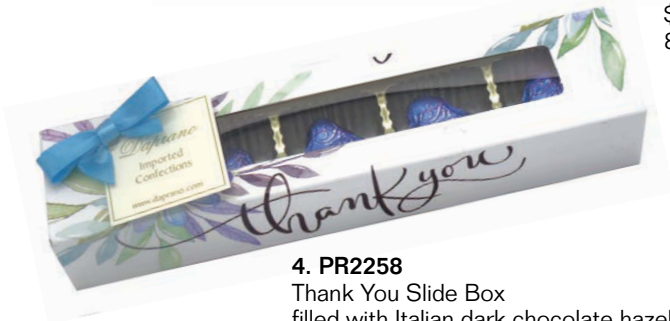
4. PR2258 Thank You Slide Box filled with Italian dark chocolate hazelnut 2.2 oz. $6.00/12 ea/$72.00 8-3/4" x 1-7/8" x 1-3/16"