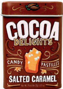
5. BS99383 Salted Caramel

For all flavors: Singles 30 g $2.05/12 ea/$24.60