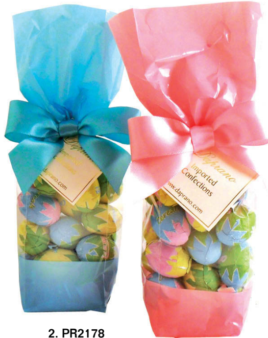
2. PR2178 Chocolate Eggs in Pink/Blue Egg Bag Set Italian chocolate 5.5 oz $6.50/12 ea/$78.00 2-1/2" x 7" x 2"