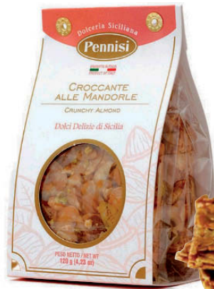
5. PN5016 Almond Brittle Pieces Bag 120 g $6.50/12 ea/$78.00