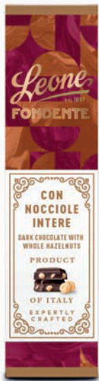
4. LE4299 Dark Chocolate Bar w/hazelnut 55 g $4.85/14 ea/$67.90