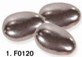
1. F0120 Silver Dipped Almonds thinly coated with real silver $22.50/5 lbs/$112.50 approx. 141 pcs per lb/$0.16 per pc

Established in 1956 in Italy, Italconfetti di Matteo produces the world's finest sugared almonds. They use the most up-to-date machinery while still maintaining their ancient production recipes. The best quality raw materials, including exceptional almonds from Sicily, are carefully handpicked by their master confectioner. In recent years a sugar-coated chocolate confection, in the shape of hearts or "Amorini", is gaining popularity. These are made with the finest dark chocolate, and offered in a variety of colors and sizes.