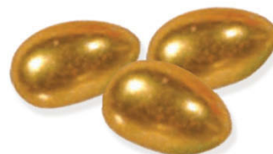
2. F0110 Gold Foiled Almonds wrapped with very thin gold foil $22.50/5 lbs/$112.50 approx. 141 pcs per lb/$0.16 per pc