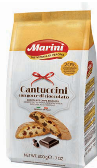
7. MR2359 Cantuccini with Chocolate 200 g $3.75/12 ea/$45.00