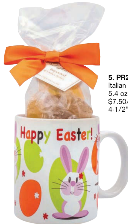
5. PR2140 Italian Assorted Fruit Gelé 5.4 oz $7.50/6 ea/$45.00 4-1/2" x 3" x 7"