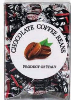
9. PRFC200 Chocolate Covered Coffee Beans 1.3 oz $3.75/12 ea/$45.00