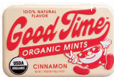
10. BS89002 Organic Cinnamon

For all flavors: Singles 40 g $2.35/6 ea/$14.10