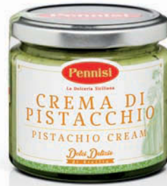
3. PN5665 Pistachio Cream 190 g $7.75/12 ea/$93.00