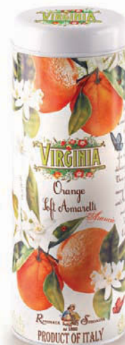
6. AV17-370 Soft Citrus Amaretti Tin Set orange and lemon 140 g $12.75/12 ea/$153.00