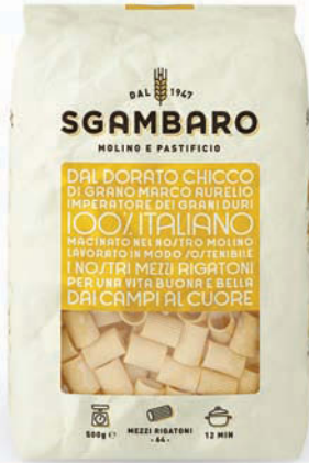
1. SG64 Rigatoni 500 g $3.50/16 ea/$56.00

Pasta from Sgamaro. Located in Northern Italy in the Veneto Region, Sgamaro has been producing pasta since 1937. Using 100% Durum Wheat sourced from the fields close to the Mill, and utilizing the finest care in the production process, Sgamaro is recognized as one of the finest pasta producers in Italy.