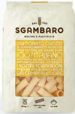
2. SG89 Tortiglioni 500 g $3.50/16 ea/$56.00