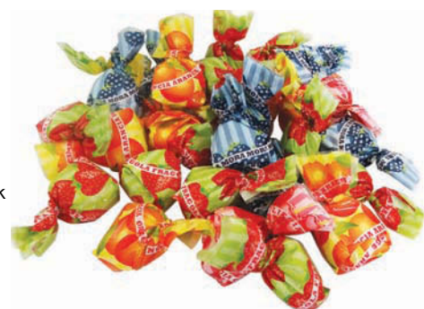
4. SPV11 Fantasy Fruit Filled Candies Bulk assorted flavors approx. 56 pcs/lb $8.50/8.8 lbs/$74.80