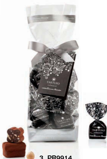
3. PR9914 5.5 oz Extra Dark bag $11.00/12 ea/$132.00