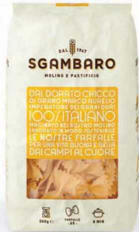
4. SG65 Farfalle 500 g $3.50/16 ea/$56.00