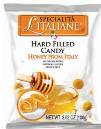
8. SP43 Italian Honey Filled Candies 100 g $2.25/12 ea/$27.00