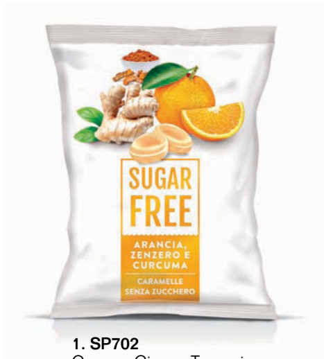
1. SP702 Orange, Ginger, Turmeric Sugar Free 80 g