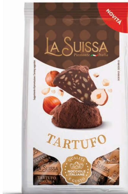
5. LS9120 Dark chocolate w/hazelnut bag 120 g $6.00/12 ea/$72.00