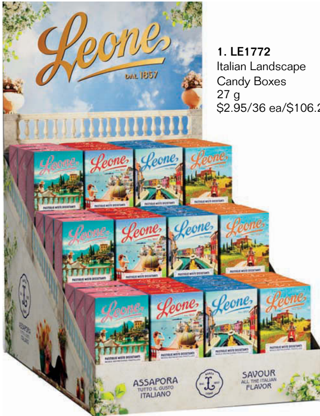
1. LE1772 Italian Landscape Candy Boxes 27 g $2.95/36 ea/$106.20