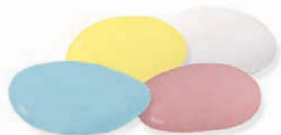
5. F0140 Pastel Extra Morena yellow, blue, pink, green and white almonds $16.25/5 lbs/$81.25 approx. 113 pcs per lb/$0.144 per pc