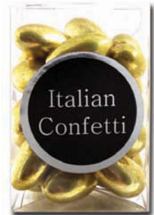
5. PRFC 110 Gold Foiled