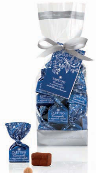
4. PR9906 5.5 oz Salted Hazelnut bag $11.50/12 ea/$138.00