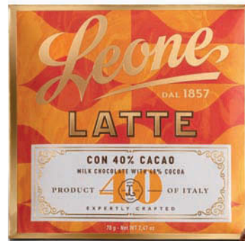
2. LE4238 Milk Chocolate 70 g $5.50/18 ea/$99.00