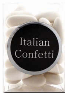
3. PRFC170 White