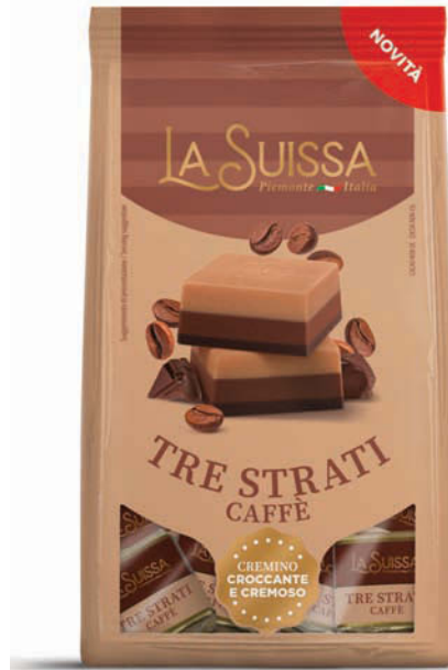
2. LS3120 Cremino dark, Giandua, coffee 150 g $6.00/12 ea/$72.00