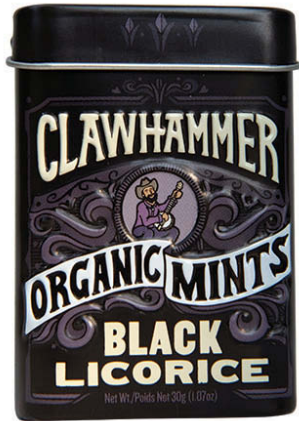
1. BS19050 Black Licorice

For all flavors: Singles 30 g $2.25/12 ea $27.00