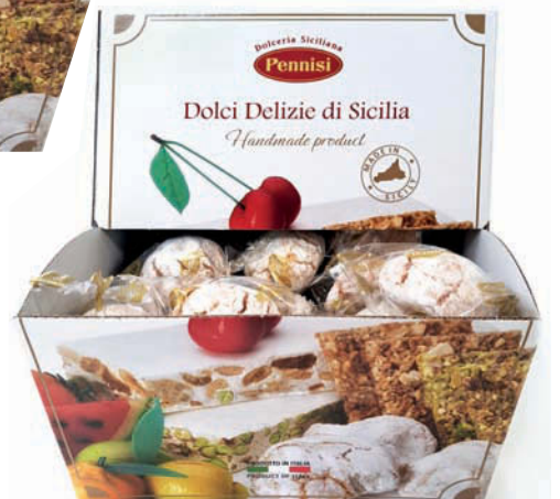
10. PN4228 Almond Pistachio Cookies 3.3 lbs 50 pcs $48.00/1 Display/$48.00