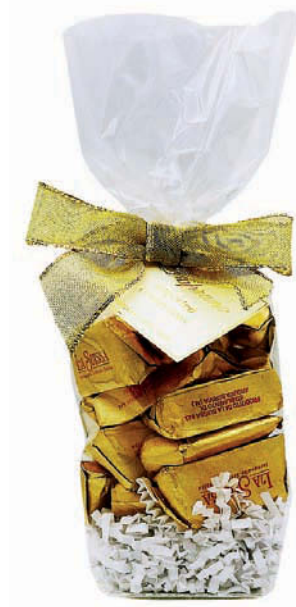
4. PR2188 Classic Gianduia 5.5 oz $10.50/12 ea/$126.00 8" x 2" x 2"