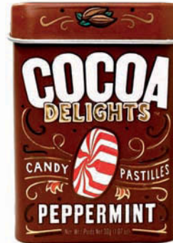
7. BS99382 Peppermint