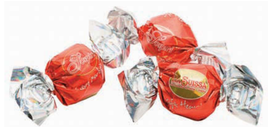
7. LS25991 Sospiri Cuore Latte milk chocolate with toffee cream approx. 36 pcs/lb $12.50/13.2 lbs/$165.00