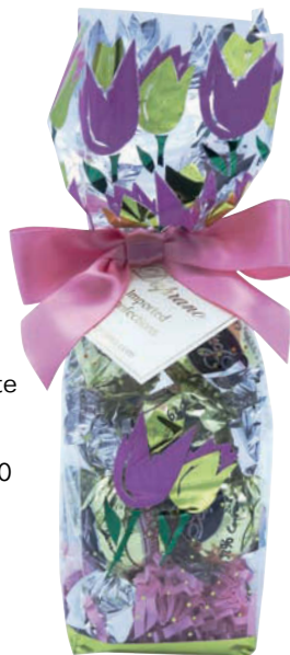
4. PR2112 Tulip Bag Italian dark chocolate w/hazelnut cream 4.6 oz $7.25/12 ea/$87.00 2-1/2" x 7" x 2"