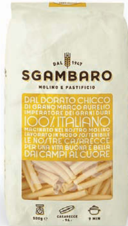
6. SG94 Casarecce 500 g $3.50/16 ea/$56.00