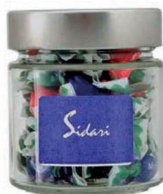
5. PR2206 Mini Italian Candy frutti di bosco (forest berries) 2.5 oz $2.50/12 ea./$30.00