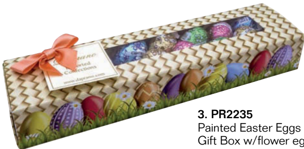
3. PR2235 Painted Easter Eggs Window Gift Box w/flower eggs 3azelnut, cocoa, coffee, creams 4.7 oz 12 pcs $6.50/12 ea/$78.00 8-3/4" x 1-7/8" x 1-3/16"