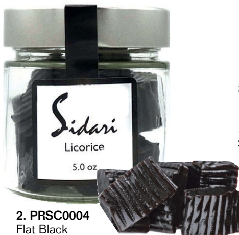
2. PRSC0004 Flat Black Licorice Jar 5.0 oz $4.50/12 ea/$54.00