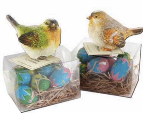
2. PR2121 Bird Topped Clear Box Set (2) with Italian chocolate eggs 2.0 oz $6.75/12 ea/$81.00 3" x 4" x 3"