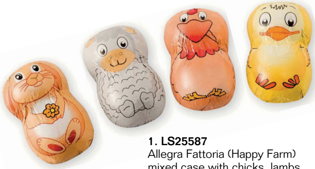
1. LS25587 Allegra Fattoria (Happy Farm) mixed case with chicks, lambs, bunnies and chickens approx. 45 pcs/lb $12.50/8.8 lbs/$110.00