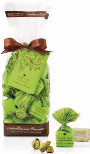
1. PR9910 5.5 oz Pistacchio bag $11.50/12 ea/$138.00