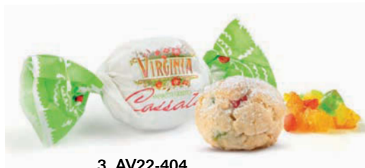
3. AV22-404 Soft Almond Cassata Bulk 5.95 lbs $18.25/5.95 lbs/$108.59