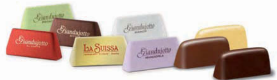
9. LS25393 Gianduia Assorted Bulk approx. 44 pcs per lb $21.00/8.8 lbs/$184.80