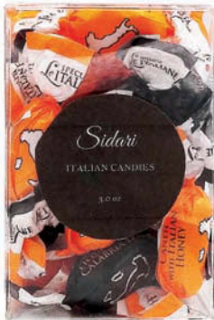
6. PRFC250 Italian Candy Soft Center Honey & Licorice 3.0 oz $3.75/12 ea/$45.00