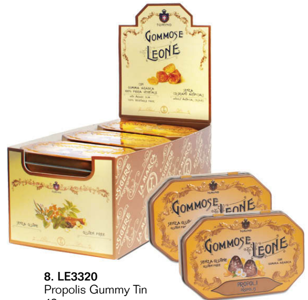
8. LE3320 Propolis Gummy Tin 42 g $5.00/9 ea/$45.00