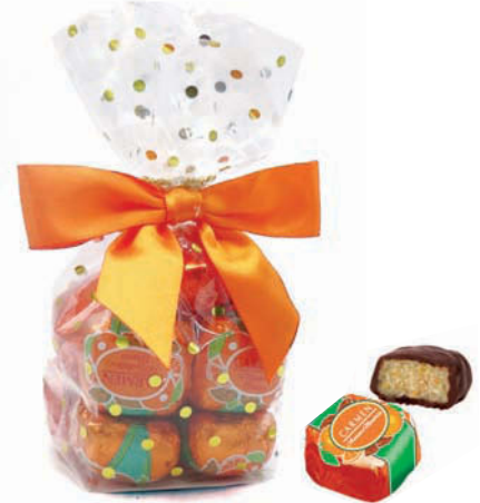
3. PR2191 Italian Dark Chocolate Praline filled with almond and orange peel pieces 4.4 oz/approx. 11 pcs $6.00/12 ea/$72.00 5" x 2-1/2" x 2"