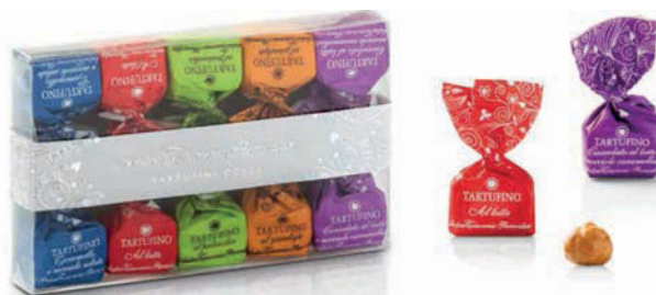
9. SB0612 Tartufini Dolci Pack assorted truffles 70 g $7.25/14 ea/$101.50