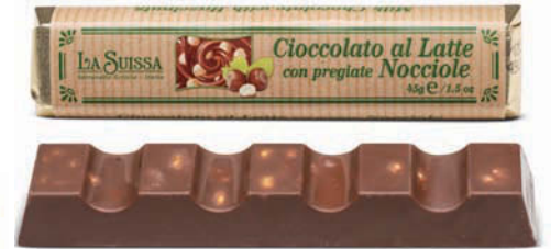
3. LS2003 Milk w/hazelnut Bar 45 g $1.70/15 ea/$25.50