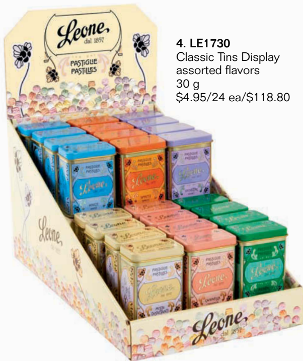
4. LE1730 Classic Tins Display assorted flavors 30 g $4.95/24 ea/$118.80