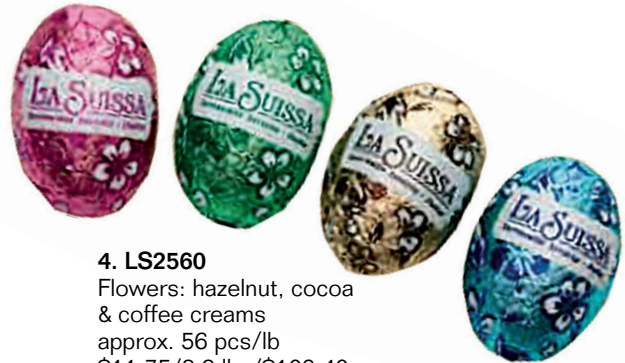
4. LS2560 Flowers: hazelnut, cocoa & coffee creams approx. 56 pcs/lb $11.75/8.8 lbs/$103.40