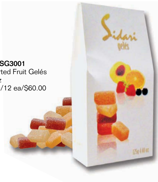
6. PRSG3001 Assorted Fruit Gelés 4.4 oz $5.00/12 ea/$60.00