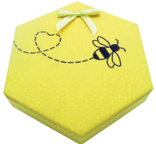
4. PR2129 Italian Honey Filled Candies 3.0 oz $6.00/6 ea/$36.00 5" x 1-1/2"