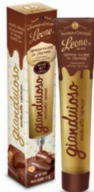
7. LE4112 Gianduiosa Paste Tube 11.5 g $8.50/12 ea/$102.00