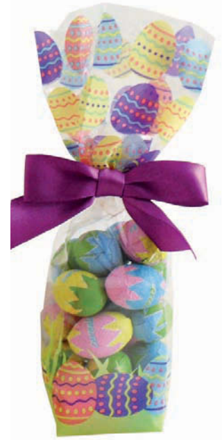
3. PR2278 Chocolate Eggs in Egg Gift Bag Italian chocolate 5.5 oz $6.50/12 ea/$78.00 2-1/2" x 7" x 2"