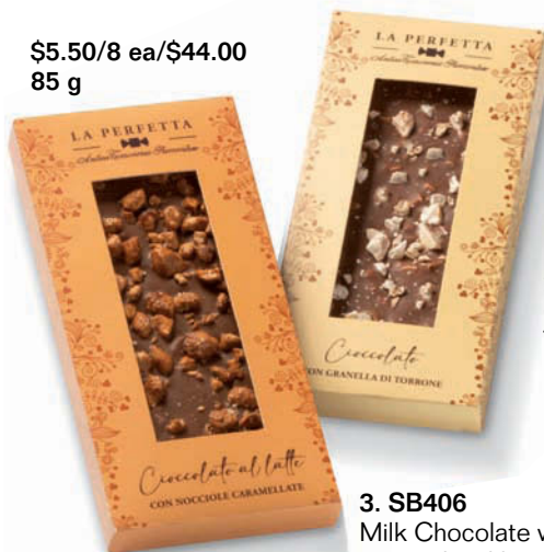
$5.50/8 ea/$44.00 85 g