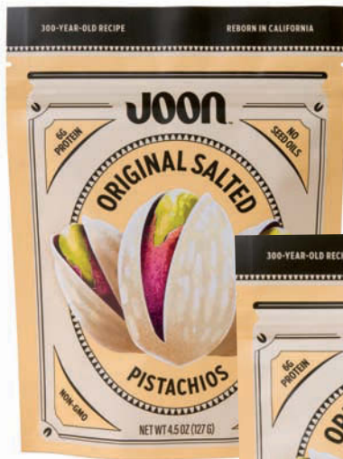
1. JN6136 Original Salted Pistachios 4.5 oz $6.75/6 ea/$40,50

JOON'S mission is simple: bring the rich, unique taste of a centuries old family pistachio recipe to your fingertips. Joon promises quality, no nonsense ingredients, and an unparalleled snacking experience.