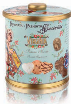
8. AV44-110 Assorted Pastries Gift Tin 260 g $21.50/6 ea/$129.00