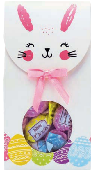
2. PR2259 Bunny Ballotin filled with Italian Ovetto Eggs 4.0 oz $8.25/6 ea/$49.50 8-3/4" x 1-7/8" x 1-3/16"