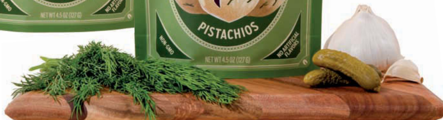
3. JN6006 Dill Pickle Pistachios 4.5 oz $6.75/6 ea/$40,50