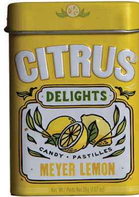
3. BS19045 Meyer Lemon