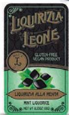
5. LE3612 Mint Licorice