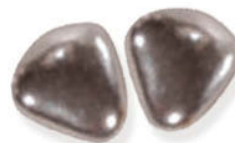
7. F0606 Little Silver Hearts (Cuoricini) small heart shaped chocolate with sugar coating $20.00/5 lbs/$100.50 approx. 410 pcs per lb/$0.05 per pc