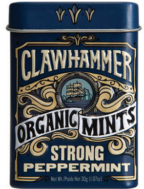
4. BS19036 Strong Peppermint