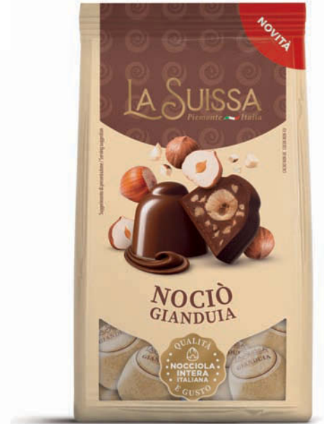
3. LS7120 Giandua w/whole hazelnut 150 g $6.00/12 ea/$72.00