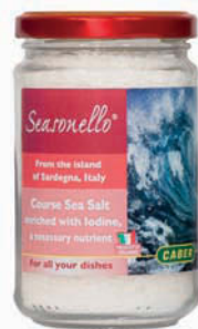
8. SD0004 Seasonello Coarse Sea Salt from the Island of Sardegna, Italy 10.58 oz $3.00/6 ea/$18.00