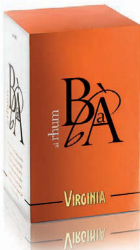
5. AV41-01 Baba al Rhum bite-size cake in rum syrup 520 g $24.00/6 ea/$144.00