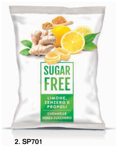
2. SP701 Lemon, Ginger, Propoli Sugar Free 80 g