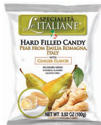
4. SP38 Emilia Romagna Pear with a hint of ginger Filled Candies 100 g $2.25/12 ea/$27.00