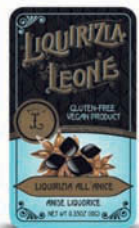
6. LE3614 Anise Licorice