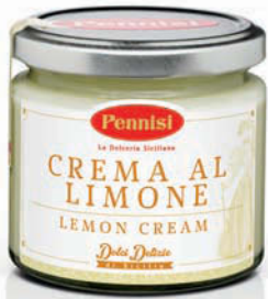
1. PN5764 Lemon Cream 190 g $7.00/12 ea/$84.00

Pennisi Dolceria Siciliana's secret is a mix of traditional and modernity, and all products are crafted for style and quality. The raw materials are highly selected and the packaging reflects traditional Sicilian products of quality and elegance. "Guardians of the Sicilian confectionery tradition"