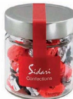
7. PR2214 Blood Orange Candy Jar 3.0 oz $2.75/12 ea./$33.00