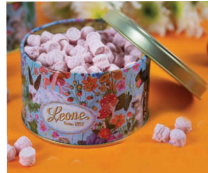
2. LE1285 Nathalie Lete Cherry Round Tin 60 g $7.00/12 ea/$84.00