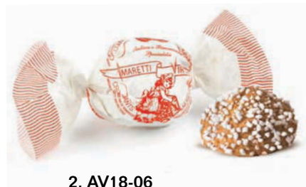
2. AV18-06 Traditional Crunchy Amaretti 7,7 lbs $16.00/7.7 lbs/$123.20