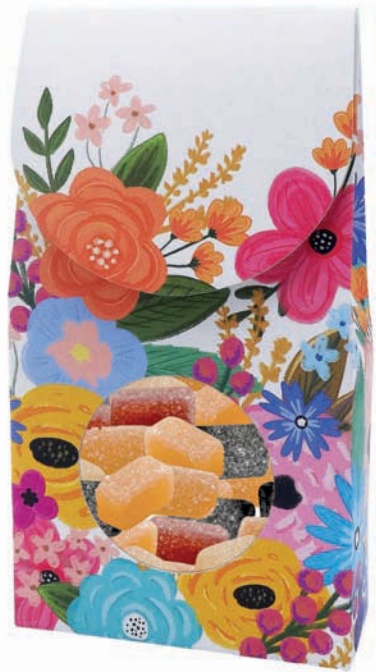
2. PR2120 Wild Flower Ballotin Italian asst. fruit Gelé 4.4 oz $7.25/12 ea/$87.00 3-1/2" x 6-1/2" x 1-3/4"