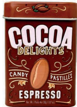
6. BS99385 Espresso