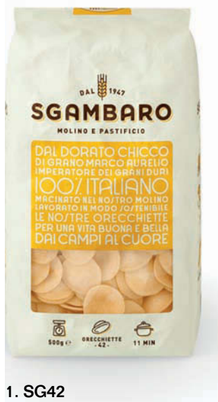
1. SG42 Orecchiette 500 g $3.50/16 ea/$56.00