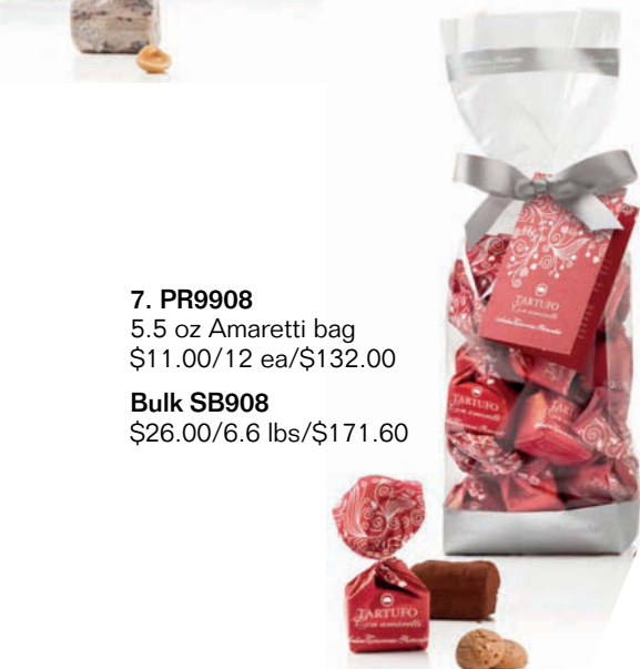
7. PR9908 5.5 oz Amaretti bag $11.00/12 ea/$132.00