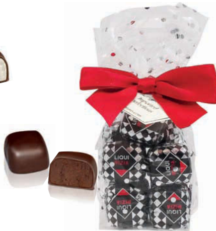
2. PR2187 Italian Dark Chocolate with Licorice 4.4 oz/approx. 11 pcs $6.00/12 ea/$72.00 5" x 2-1/2" x 2"