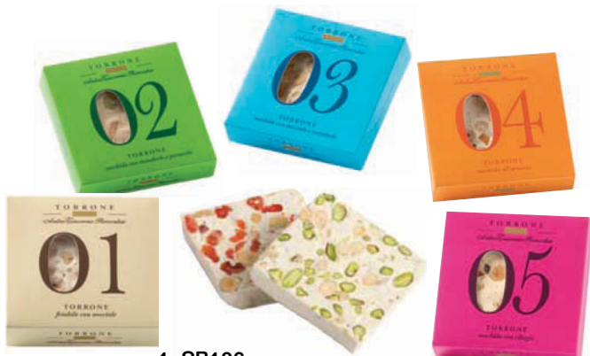
1. SB106 Soft Nougat Squares Assorted Case all wrapped nougat squares, 10 pcs 80 g $6.50/10 ea/$65.00

Master producer of premium nougat, chocolates and biscuits from Italy. Founded in 1885, the Sebaste brand, including the 'Antica Torroneria Piemontese' selections, has become renowned for using quality ingredients and promoting traditional flavors. Their confections are beautifully presented, and even better to eat! We hope you add them to your offerings as well.