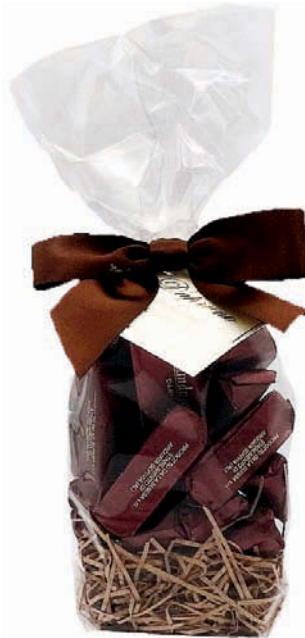
5. PR2189 Dark Gianduia 5.5 oz $10.50/12 ea/$126.00 8" x 2" x 2"