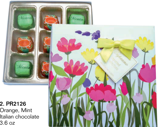
2. PR2126 Orange, Mint Italian chocolate 3.6 oz 12 pcs. $8.00/12 ea/$96.00