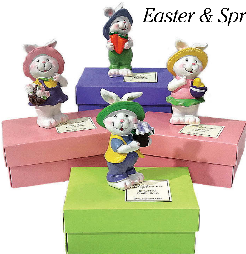
1. PR2238 Garden Bunnies Gift Box Asst Filled w/Italian chocolate eggs 4.2 oz $10.00/8 ea/$80.00 5-1/2" x 5" x 3-1/2"