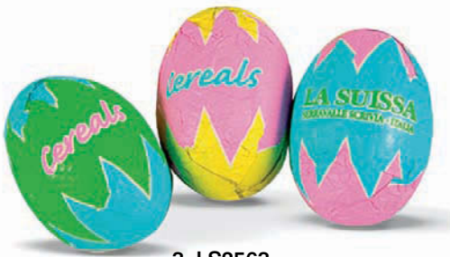
3. LS2563 Pastels: milk chocolate with milk cream & crisps approx. 57 pcs/lb $11.75/8.8 lbs/$103.40