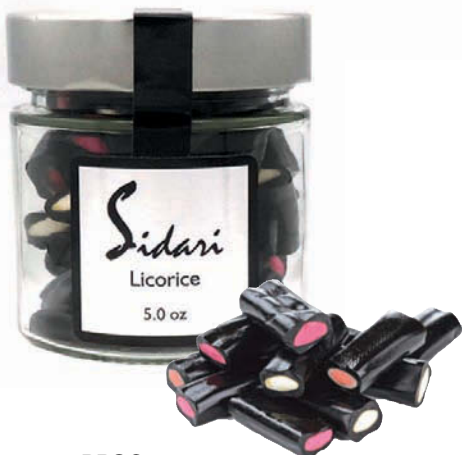
1. PRSC0002 Assorted Fruit Licorice Jar 5.0 oz $4.50/12 ea/$54.00