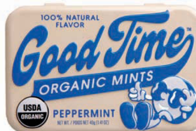
11. BS89001 Organic Peppermint