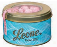
6. LE2772 Roses candies in round window tins 150 g $7.50/12 ea/$90.00