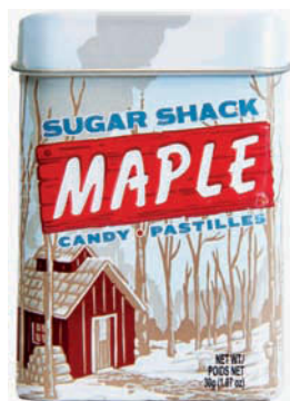
9 BS19318 Maple 30g $2.05/12 ea/$24.60

SUGAR FREE Big Sky Mints For all flavors: $1.95/6 ea/$11.70