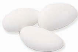
3. F0170 White Tenderly Almonds perfect for wedding favors $19.00/5 lbs/$95.00 approx. 113 pcs per lb/$0.168 per pc