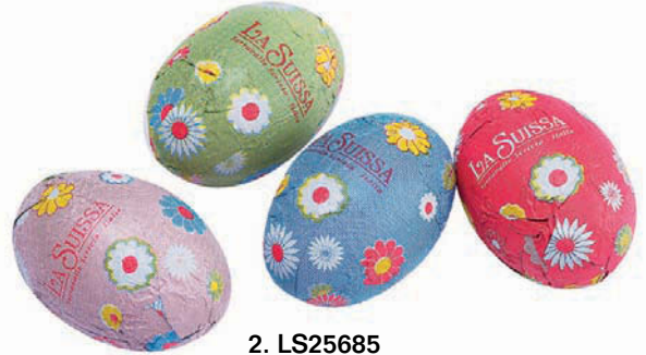
2. LS25685 Daisy Foil Chocolate Eggs milk chocolate, cocoa cream and cereal approx. 56 pcs/lb $11.75/8.8 lbs/$103.40