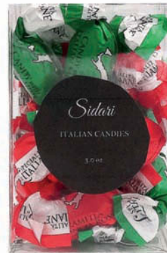
8. PRFC270 Italian Candy Soft Center Blood Orange & Mint 3.0 oz $3.75/12 ea/$45.00