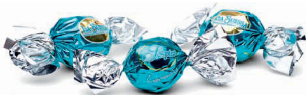
6. LS2592 Milk chocolate with cereal filling $12.50/13.2 lbs/$165.00