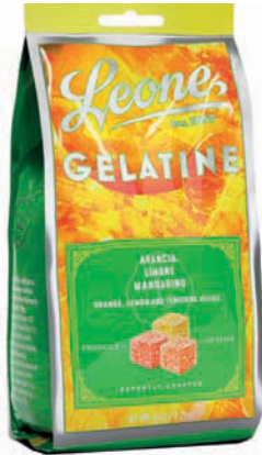
2. LE2858 Citrus Fruit Jellies 150 g $8.50/6 ea/$51.00