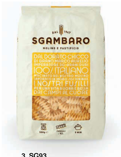
3. SG93 Fusilli 500 g $3.50/16 ea/$56.00