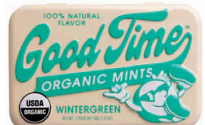
12. BS89003 Organic Wintergreen