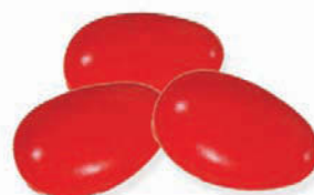
4. F0240 Dark Red Extra Napoli Almonds $16.25/5 lbs/$81.25 approx. 125 pcs per lb/$0.144 per pc