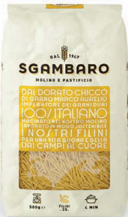
5. SG35 Filini 500 g $3.50/16 ea/$56.00