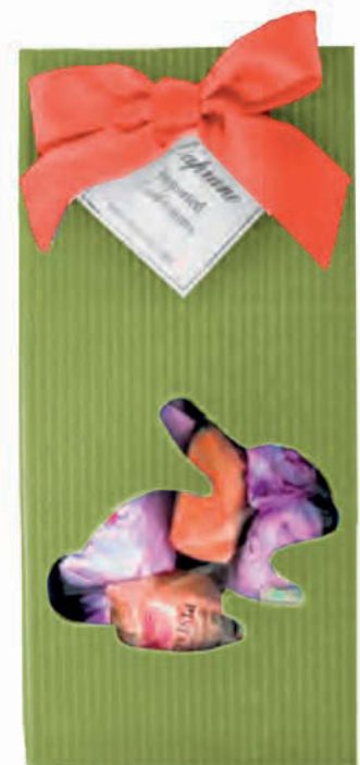
5. PR2282 Bunny Ballotin filled with Italian Chocolates almond and pistachio 5.5 Oz $8.25/12 ea/$99.00 8-3/4" x 1-7/8" x 1-3/16"