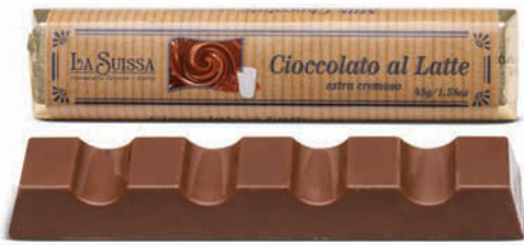
1. LS2001 Milk Bar 45 g $1.70/15 ea/$25.50