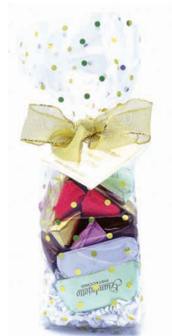
6. PR2184 Assorted Gianduia Bag 5.5 oz $10.50/12 ea/$126.00 8" x 2" x 2"