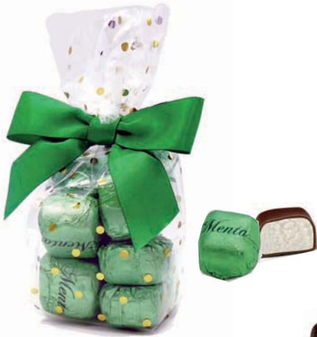
1. PR2193 Italian Dark Chocolate with Peppermint 4.4 oz/approx. 11 pcs $6.00/12 ea/$72.00 5" x 2-1/2" x 2"