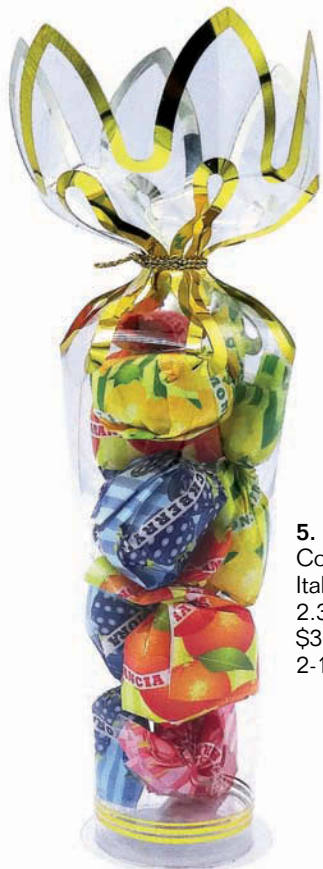
5. PR2142 Coronet Fantasia Italian fruit candy 2.3 oz $3.00/12 ea/$36.00 2-1/2" x 7" x 2-1/2"