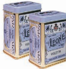
3. LE1057 Violet Tin violet flavored candies 30 g $4.95/12 ea/$59.40