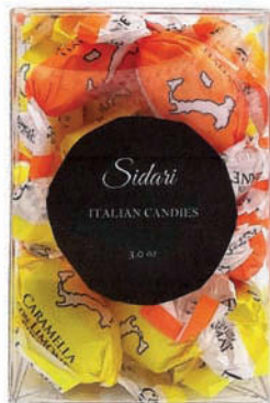
7. PRFC260 Italian Candy Soft Center Lemon & Honey 3.0 oz $3.75/12 ea/$45.00