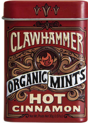
2. BS19037 Hot Cinnamon