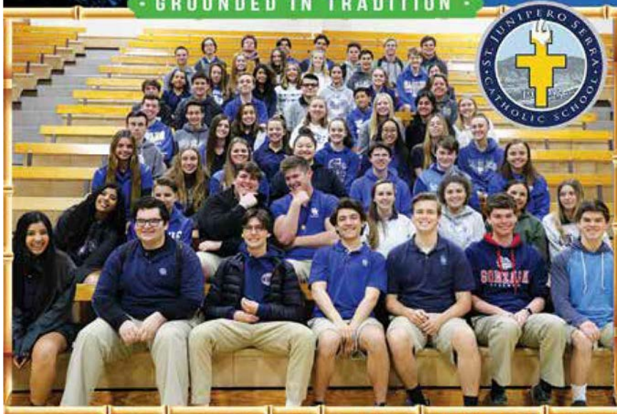
Photo: St. Junipero Serra Catholic School graduates