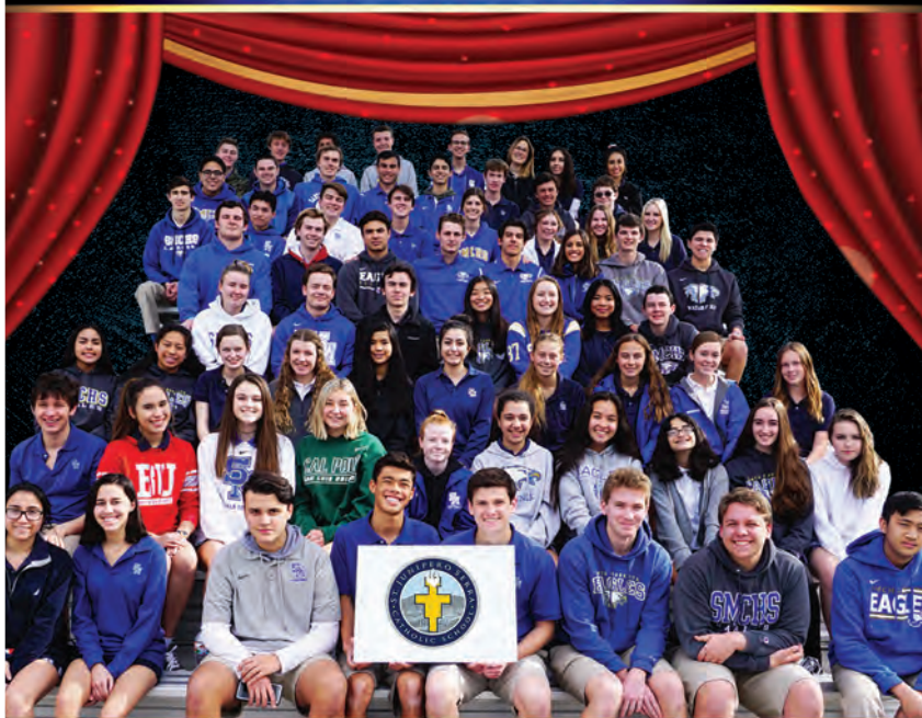
Photo: St. Junipero Serra Catholic School graduates