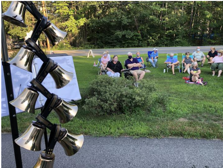
The view from the bell tree at Lee Congregational Church

Other churches are finding ways to meet – carefully – often outside, masked-up, and socially distanced. On July 29, the Lee Congregational Church held a small outdoor Vespers service, which incorporated “Dona Nobis Pacem” and “Simple Gifts” on bell tree. The service brought a beautiful moment of peace and stillness to everyone who attended (and everyone who walked by).