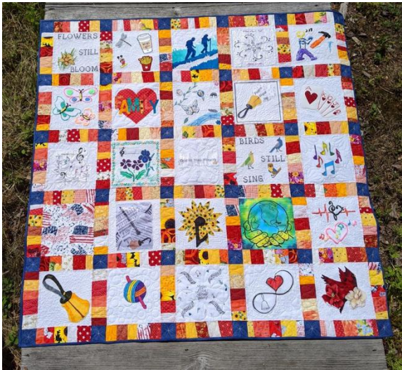
GSR Community Quilt