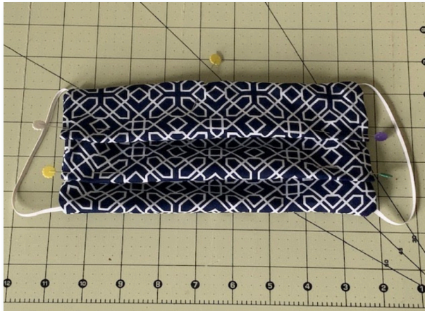
Step 9 - Make tucks to form pleats.