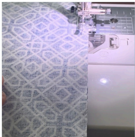
Step 4 - Sew to first corner.