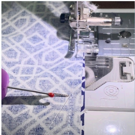
Step 6 - Continue sewing edges.