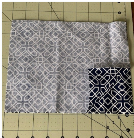
Step 3 - Position fabric.