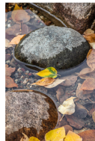
Fallen Autumn Leaves