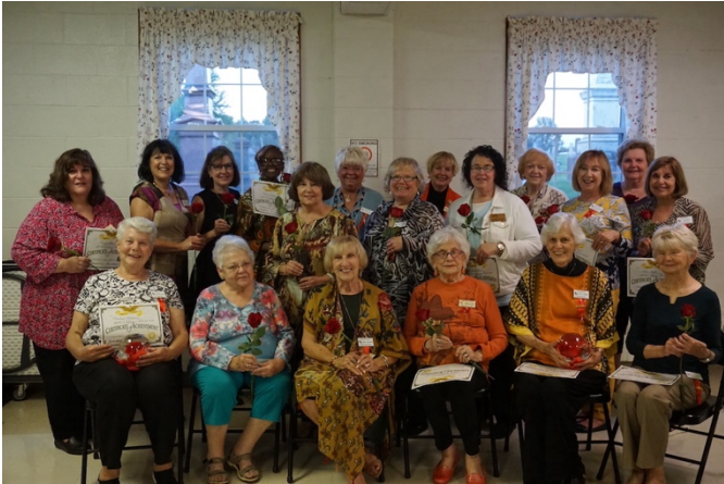
Alpha Omega recently recognized chapter members with twenty-five to fifty-two years membership. They were honored with certificates and red roses.