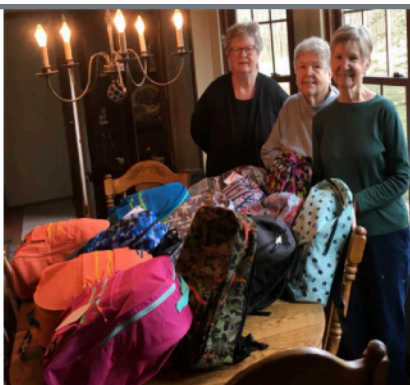
Foster Care Project is a Delta Chi Success!