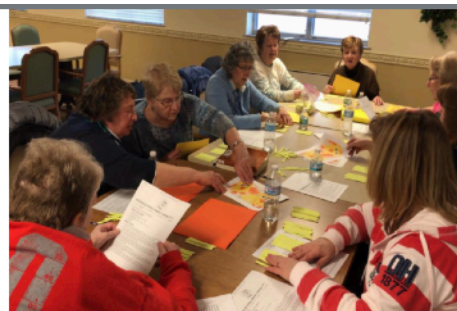
Beta Delta met at Arlington Care Center and made crafts for residents' trays.