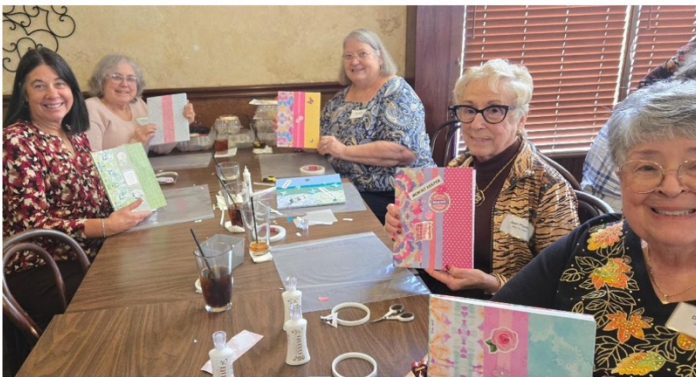
Delta Kappa Chapter met at Amber Rose Restaurant for a delicious lunch and activity. The speaker discussed the importance of journaling and guided us through making our own journals to keep or give as a gift.