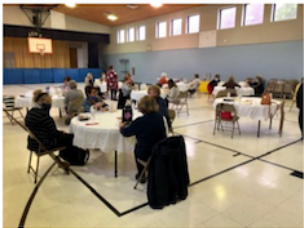
Yes, it is a basketball court! Chi Chapter enjoyed our first in-person meeting while socially distancing and wearing masks in a church gymnasium. Boxed meals were served and plenty of hand sanitizer was on hand!