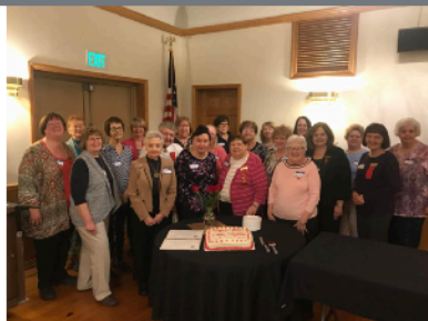
Kappa Chapter members celebrate 80th Anniversary of chapter's founding.