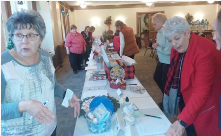
Beta Eta Chapter held a combination live and silent auction to raise money for Imagination Library and the Beta Eta Chapter Scholarship fund. Members donated craft and food items for the auction.