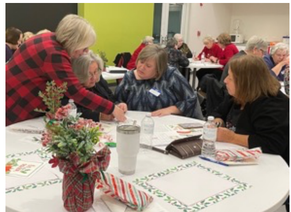
At Beta Kappa's December 6th meeting, members celebrated the holiday season with a number of holiday games. Chapter members at each table worked together to solve a "Christmas Carol" crossword puzzle.