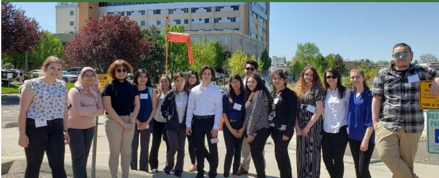
Delta high school students pose for group photo after job shadow experience (Pasco)

As this work moves forward, a more explicit role for higher education to engage in this work may be