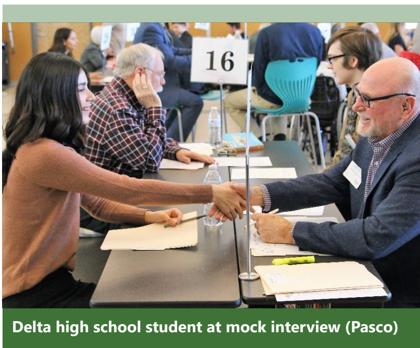
Delta high school student at mock interview (Pasco)