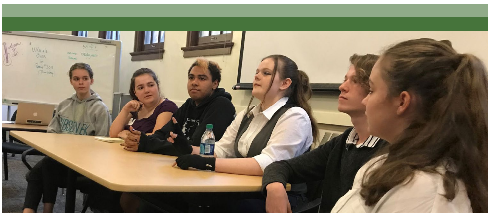
Avanti, Discovery, Gibson Ek High School students present to the MBL Work Group (Olympia)

Find charges to the Work Group from ESSHB 1599 Sec. 301 on SBE's web page .