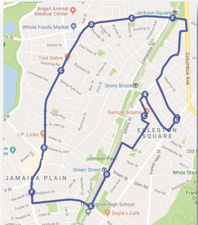
Trolley Route for Porchfest and Open Studios