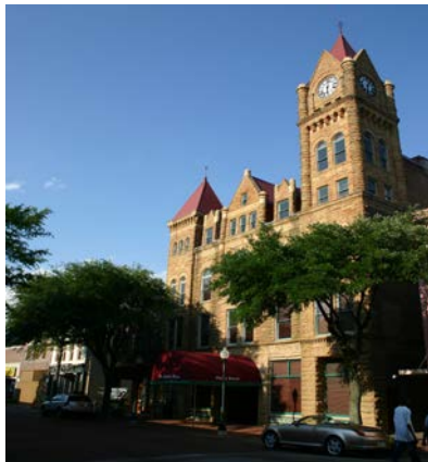
Sumter Opera House 21 N. Main Street Sumter, South Carolina