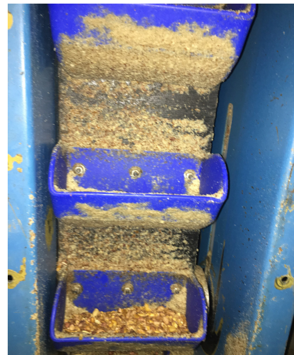
Peanut Build-Up Inside Buckets

The peanut meal build-up in the buckets reduced capacity and damaged the peanuts to the point that the elevator had to be shut down every three to four weeks to have all the buckets washed and the boot and head pulleys cleaned to reduce damage to the peanuts and improve system capacity. The elevator incorporated a solid drum style boot pulley that made the situation worse as peanuts fell between the boot and pulley.