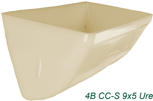
4B CC-S 9x5 Urethane Elevator Bucket With Vent #3 Pattern Holes.

Replace blue unvented CC-HD 9 X 5 Polyethylene buckets with 4B CC-S 9 x 5 Urethane elevator buckets incorporating vent holes. Replace boot pulley with self-cleaning wing style pulley.