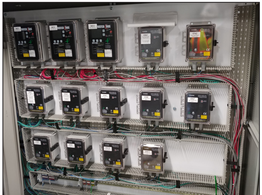
Panel of IE-Nodes