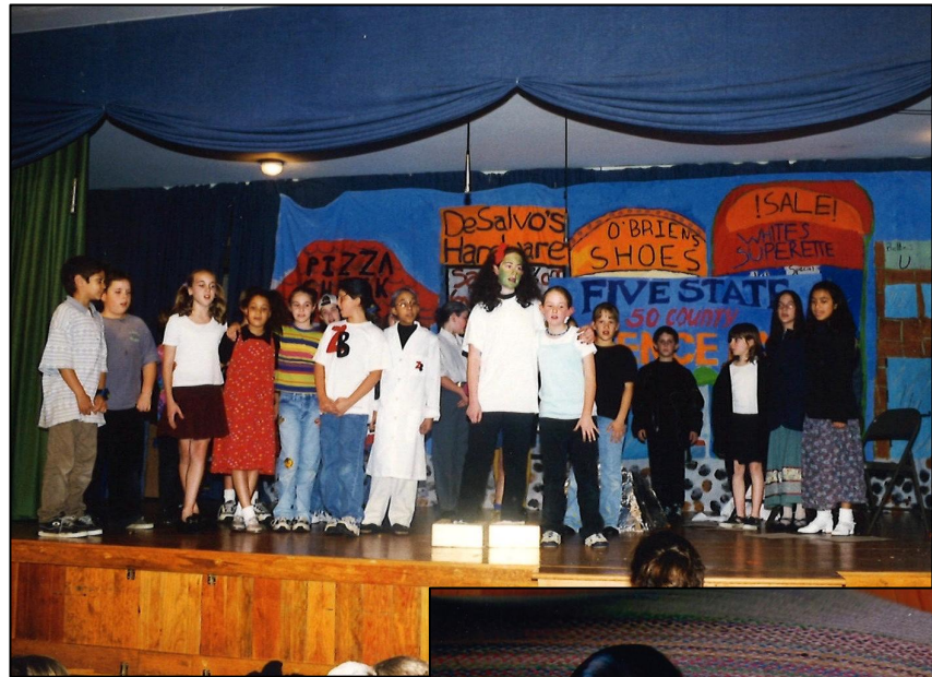
These photos: Undated