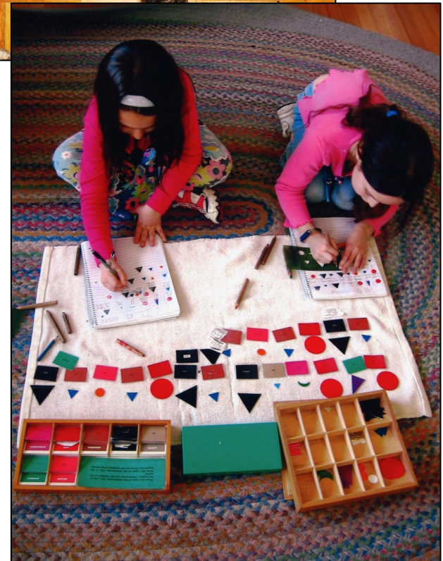
Poster: From 1995