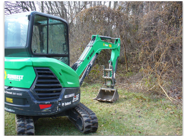
The beginnings of the Chang Trail