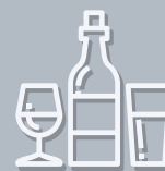
BREWERY, WINERY, OR TASTING ROOM