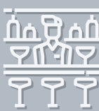
BAR, LOUNGE, INN, TAVERN, OR SALOON