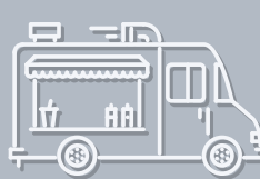
FOOD TRUCK, CART, OR STAND