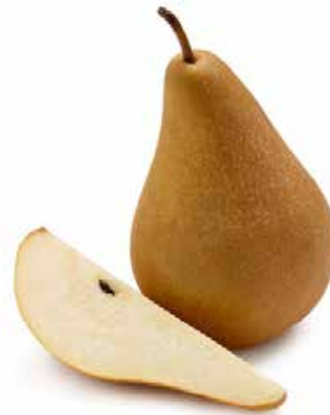
BOSC PEAR 60-70 ct. [WA] BOSC PEAR 110 ct. [WA]

Unique in appearance and memorable in taste! Asian pears are round and squat, with a green-yellow skin that is often speckled with brown spots. Extremely crispy and juicy, Asian pears are prized not only for their texture but for their subtly sweet flavor as well. Asian pears are also non-climacteric, meaning they mostly won’t continue to ripen after picking.