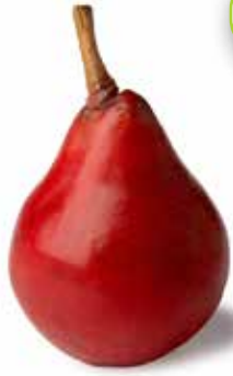
RED PEARS 135 ct. [WA]

Starkrimson pears are named for their brilliant crimson red color and feature a thick, stocky stem. They are one of the few pears whose skin changes color as it ripens. The Starkrimson is a mild, sweet pear with a subtle floral aroma. It is very juicy when ripe and has a pleasant, smooth texture, making it perfect for snacking, salads, or any fresh use that shows off the brilliance of its skin.