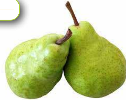
BARTLETT PEAR 70 ct. [WA]

Starkrimson pears are named for their brilliant crimson red color and feature a thick, stocky stem. They are one of the few pears whose skin changes color as it ripens. The Starkrimson is a mild, sweet pear with a subtle floral aroma. It is very juicy when ripe and has a pleasant, smooth texture, making it perfect for snacking, salads, or any fresh use that shows off the brilliance of its skin.