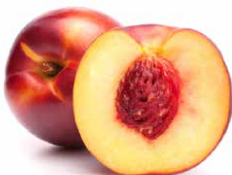
LG NECTARINES 2-layer [CHL]