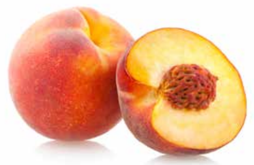
LG PEACHES 2-layer [CHL]