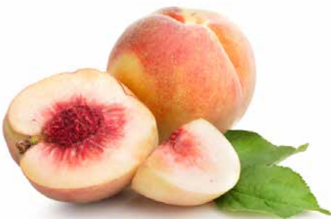
WHITE PEACHES Single Layer [US]