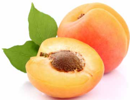
APRICOT 2-layer [CHL]