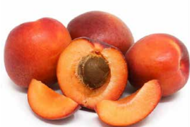
RED APRICOTS 12/2 lb.[US]