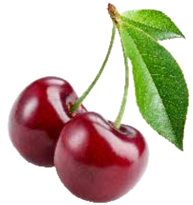
LG RED CHERRIES 16 lb.[US]