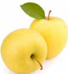
GOLDEN DELICIOUS 40 lbs. [WA]

Golden Delicious apples are firm, crisp, and white-fleshed. These apples have a balanced sweet-tart aromatic flavor, which has been described as honeyed. The flavor varies depending on where these apples are grown; in a cool climate, the amount of acid increases, actually creating a sweeter flavor.