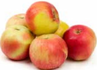
MCINTOSH 40 lbs. [NY]

The McIntosh apples crisp flesh is exceptionally juicy and bright white in color. When first picked the flavor of the McIntosh apple has a strong sweet-tart taste with nuances of spice, this flavor will mellow slightly in cold storage.