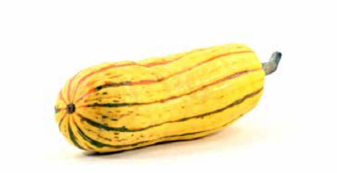
ORGANIC DELICATA SQUASH 35 lbs. [WA]

Sweet, slightly nutty vegetable flavored flesh dark green skin, patched with orange packed with fiber.