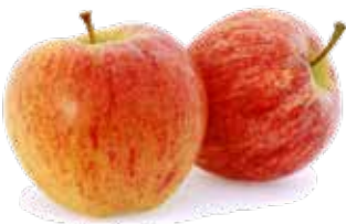
GALA 40 lbs. [WA]

An all-purpose apple that is thin-skinned and a pale, golden yellow color with red-blushed stripes. The flesh is firm and crisp with a slight yellow to cream color. Gala is a mildly sweet apple and has a vanilla-like taste with floral notes.