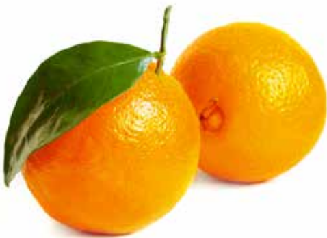
NAVEL ORANGES 56 ct. [CA]

Also known as the “belly button” orange for the pronounced opening at the blossom end. They are a meaty orange with a very thick rind. Navels’ segments tear away very easily; making them a favorite citrus for fresh eating.