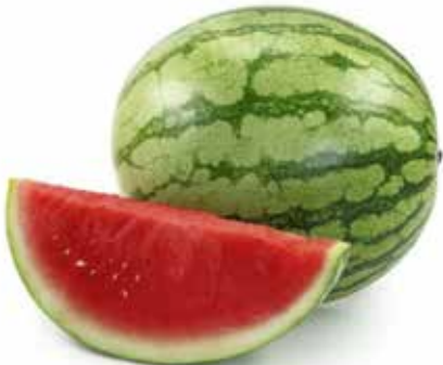
MINI WATERMELON 6 ct. [MX]

Mini Watermelons are about the size of a cantaloupe or smaller. The convenient size makes them easy for a perfect individual snack serving size. These miniature watermelons are sweet, crisp and contain an abundance of juice. Look for a creamy white appearance where the melon sat on the ground. This indicates ripeness.