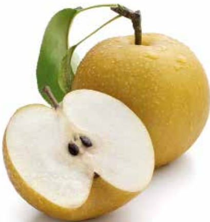
ASIAN PEARS 14 ct. [CA]

D'Anjou pears are a medium-sized variety, with a slightly egg-shaped appearance. The green-skinned pears have a short, squat body and almost no neck typical of a pear. The bright green skin is often blushed with a rose flush on the side most exposed to the sun while on the tree. The flesh of the D'Anjou pear is bright, white and dense with a slightly sweet flavor with subtle notes of citrus.