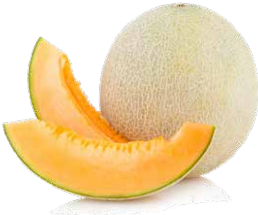
CANTALOUPE 12 ct. [CA]

Mini Watermelons are about the size of a cantaloupe or smaller. The convenient size makes them easy for a perfect individual snack serving size. These miniature watermelons are sweet, crisp and contain an abundance of juice. Look for a creamy white appearance where the melon sat on the ground. This indicates ripeness.