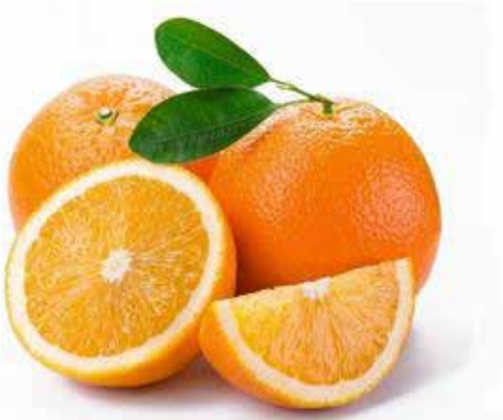
FL ORANGE 100 100 ct. [FL]

Blood oranges possess a distinctive flavor compared to other sweet oranges like navels. This citrus variety is considered less acidic in taste than the navel and often contains overtones of berries such as raspberry or strawberry.