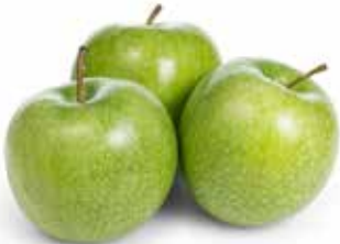
GRANNY SMITH 40 lbs. [WA]

Granny Smith will make anyone's face pucker up thanks to its strong tartness. It's very firm with loads of juice and lemon-like acidity and just enough sweetness.