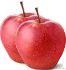
RED DELICIOUS 40 lbs. [WA]

Red Delicious has a sweet but very mild flavor, somewhat reminiscent of slightly over-ripe melon. The flesh is juicy and has a light crispness. The skin can be quite tough. Overall Red Delicious can be quite a refreshing apple to eat, but its chief characteristic is that it has almost no flavor at all.