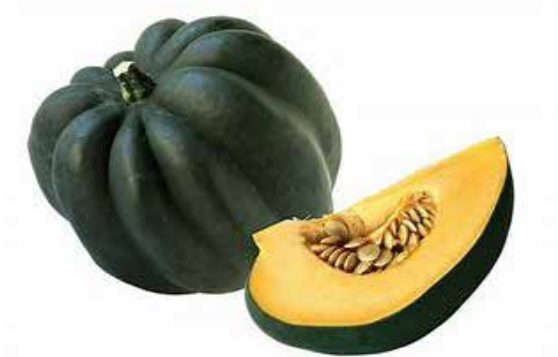
ORGANIC ACORN SQUASH 35 lbs. [WA]

Mild & sweet flavor flesh comes out like pasta strands when cooked - hence the name.