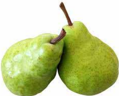
BARTLETT PEAR 60/70 ct. [WA] BARTLETT PEAR 120 ct. [WA]

Unique in appearance and memorable in taste! Asian pears are round and squat, with a green-yellow skin that is often speckled with brown spots. Extremely crispy and juicy, Asian pears are prized not only for their texture but for their subtly sweet flavor as well. Asian pears are also non-climacteric, meaning they mostly won't continue to ripen after picking.