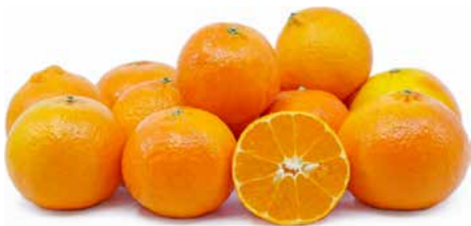
TANGERINES 64 ct. [FL]

Sugar-sweet, brilliant red-orange tangerines are so easy to peel and enjoy. Their smaller “snacking” size makes them a favorite with kids and a great lunchbox addition. Squeeze up a few of our tangerines to make a gorgeous glass of bright-orange, perfectly flavor-balanced juice.