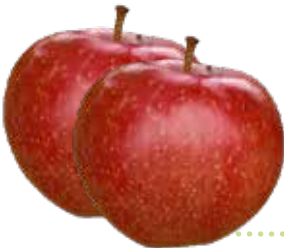
SWEETANGO 40 lbs. [NY]

Sweetango is crisp and sweet, with a lively touch of citrus, honey and spice. This apple offers unmatched texture – perfectly crunchy and satisfyingly juicy. Try Sweetango and you too may find yourself joining fans who declare “best apple ever!” or “perfect flavor and crunch.