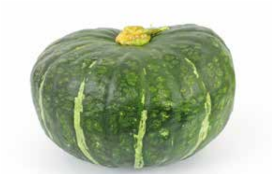
ORGANIC BUTTERCUP SQUASH 35 lbs. [WA]

Yellow flesh, tastes like a sweet potato, edible shell - no peeling needed.