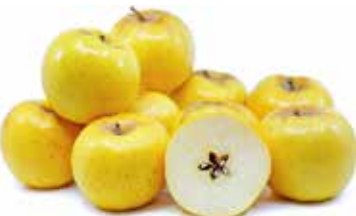
OPAL EURO 45 ct. [WA]

Opal® apples can't be compared to an everyday apple. These sunny fruits are like none other — with a beautiful appearance, distinctively crunchy texture, floral aroma and a sweet, tangy flavor. But one of the most incredible and natural features of this apple is that it does not brown after cutting.