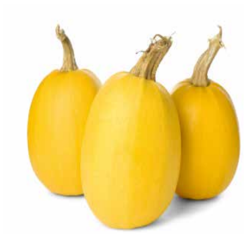
ORGANIC SPAGHETTI SQUASH 35 lbs. [WA]

Mild & sweet flavor flesh comes out like pasta strands when cooked - hence the name.