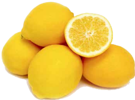
MEYER LEMON 10 lbs. [NZD]

Star Ruby grapefruit is the benchmark standard of grapefruits regarding color, flavor and fragrance. Its rough, globular exterior is yellow-orange with a blush of rose. The peel is bittersweet, substantial and lacking fragrance until it is punctured or zested, when it then releases a bouquet of citrus aromatics.