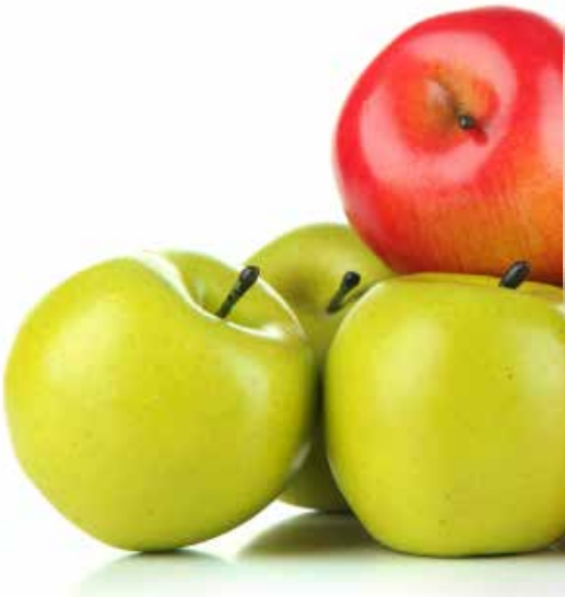
SNAP DRAGON 12/2 lb. [NY]

Red Delicious has a sweet but very mild flavor, somewhat reminiscent of slightly over-ripe melon. The flesh is juicy and has a light crispness. The skin can be quite tough. Overall Red Delicious can be quite a refreshing apple to eat, but its chief characteristic is that it has almost no flavor at all.