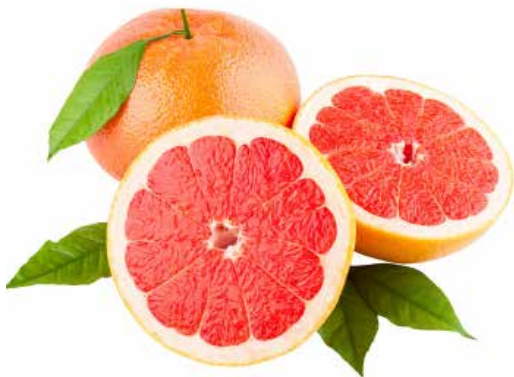
RED GRAPEFRUIT 27 ct. [FL]

Also known as the “belly button” orange for the pronounced opening at the blossom end. They are a meaty orange with a very thick rind. Navels’ segments tear away very easily; making them a favorite citrus for fresh eating.