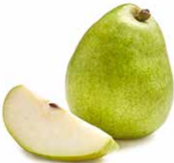
D'ANJOU 60 ct. [WA] D'ANJOU 110/120 ct. [WA]

Starkrimson pears are named for their brilliant crimson red color and feature a thick, stocky stem. They are one of the few pears whose skin changes color as it ripens. The Starkrimson is a mild, sweet pear with a subtle floral aroma. It is very juicy when ripe and has a pleasant, smooth texture, making it perfect for snacking, salads, or any fresh use that shows off the brilliance of its skin.