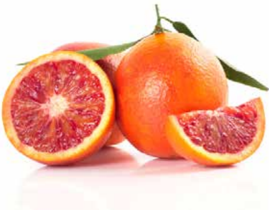
BLOOD ORANGE 88 ct. [CA]

Noble Florida Starburst Pummelos are the perfect variety to expand your citrus portfolio and targetgourmet-trendy shoppers. As the largest citrus fruit grown on Earth, this variety has a feel of a Grapefruit with sweet flavor. In fact, Florida Pummelo contain 40% less acid than Grapefruit and packed with nutrition!