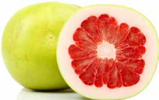
PUMMELO 10 ct. [FL]

Sugar-sweet, brilliant red-orange tangerines are so easy to peel and enjoy. Their smaller “snacking” size makes them a favorite with kids and a great lunchbox addition. Squeeze up a few of our tangerines to make a gorgeous glass of bright-orange, perfectly flavor-balanced juice.