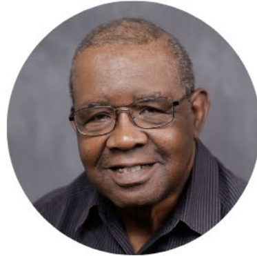
JAMES BROWN Magic Carpet Tours Bus Services