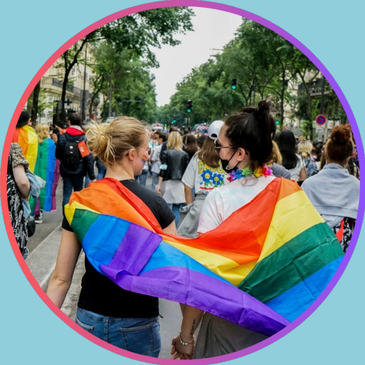
Santa Cruz Pride is a previous recipient of a City of Santa Cruz Special Event Grant.

Apply by April 16. Awards will be announced on June 2.