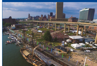
Visit to Buffalo's Canalside