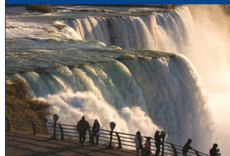
World's most famous Falls

Day 9: Today after enjoying a Continental Breakfast, you depart for home... a time to chat with your friends about all the fun things you've done, the great sights you've seen and where your next group trip will take you!