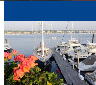
Enjoy the historic Portland Waterfront