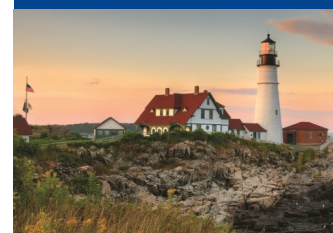
See the Portland Head Lighthouse