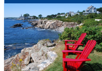
Explore quaint Kennebunkport