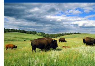
Wildlife enhances the pristine Black Hills