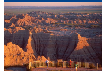
Spectacular Badlands National Park