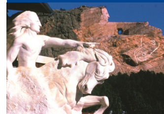
Crazy Horse Monument to be 10x the size of Mt. Rushmore