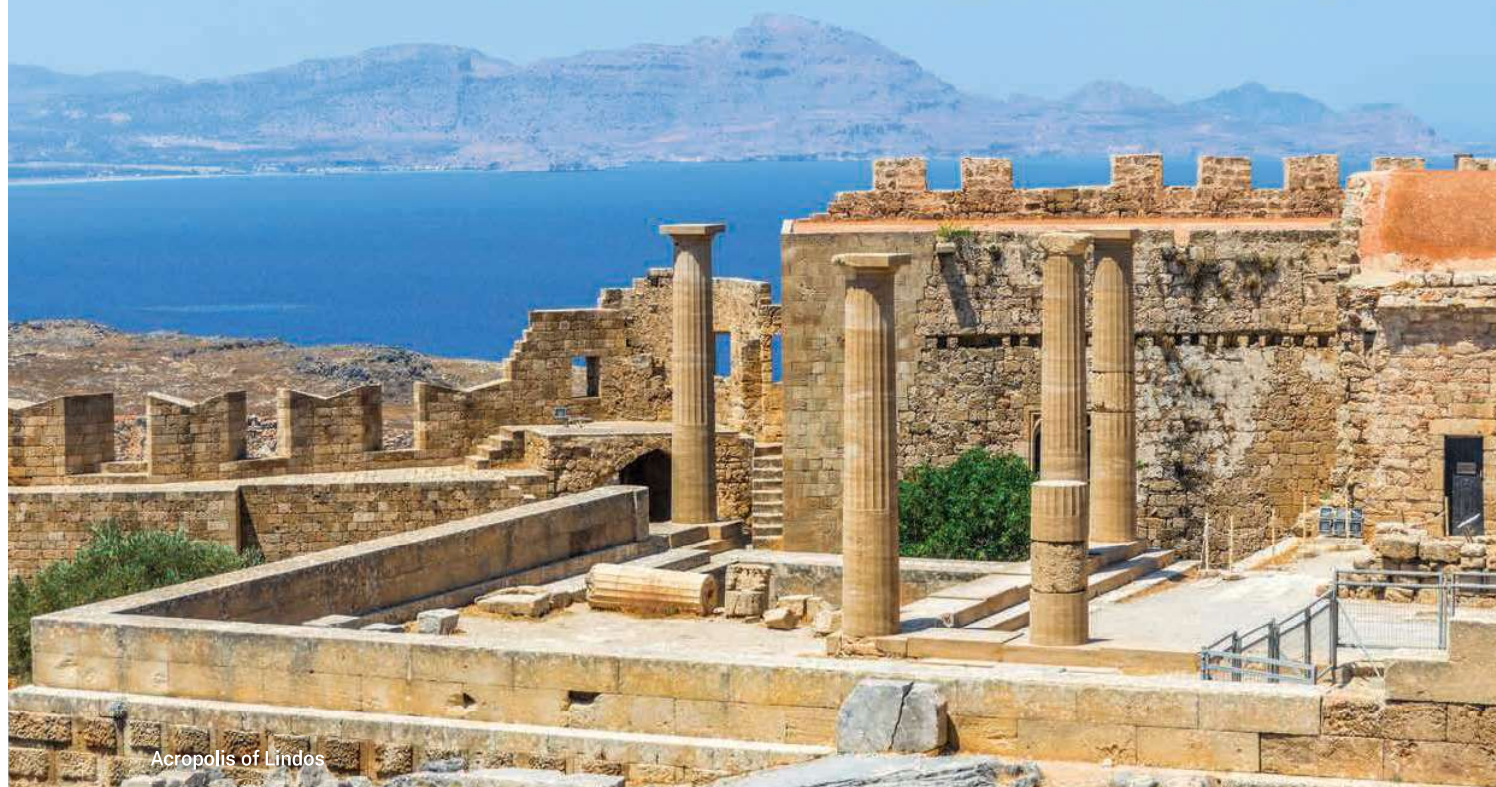
Acropolis of Lindos