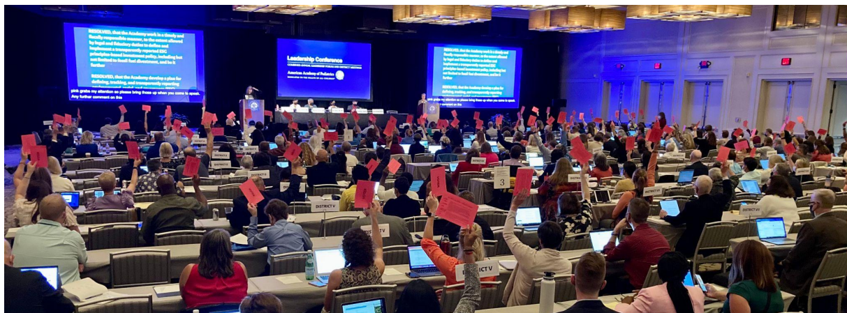
(Image) Pediatricians Representing all chapters raise their red cards in support of a resolution.