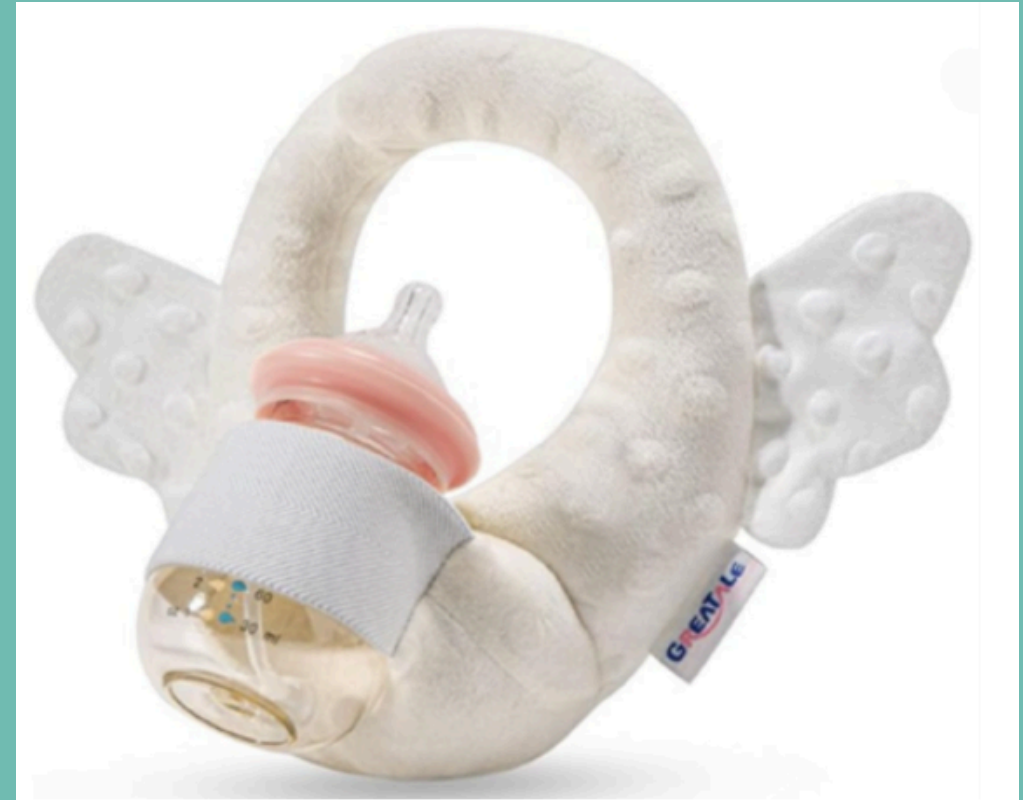
Micololy Self-Feeding Pillows