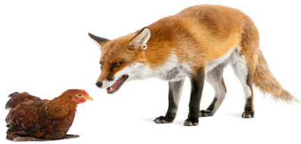
Who let the fox in?

It is painful and very difficult for good people to admit that such grievous acts could be deliberate and committed by their own government, but if we are ever to return our country to the rule of law, we must accurately address the motive of those who have so brazenly violated it.