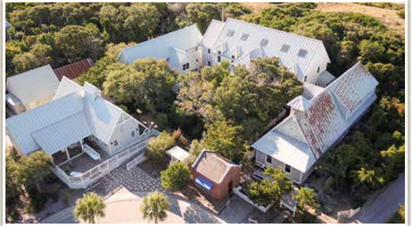
BHI Conservancy campus.

Thank you and happy holidays from the Bald Head Island Conservancy! 🐢