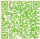
Golf Cart Registration

To complete your online registration, you will need your insurance policy and a credit card. Please inspect your cart registration sticker before applying for a yearly renewal sticker. If your registration sticker is torn, faded, peeling, or damaged in any way please choose the option to pick up your annual registration at the Public Safety Building. When you arrive at the Public Safety Building, you will need to request a new cart sticker (you will be assigned a new registration number). The online registration can be completed here: https://villagebhi.org/residents-owners/submit-a/golf-cart-electric-vehicle-registration/ or use the accompanying QR code. If you select the option to pick up the new sticker at the Public Safety Department (vs. having it mailed), please allow some time for us to process your registration. It has been taking longer each year as more carts are put into service. Take note of the date that you submitted your renewal and check the golf cart