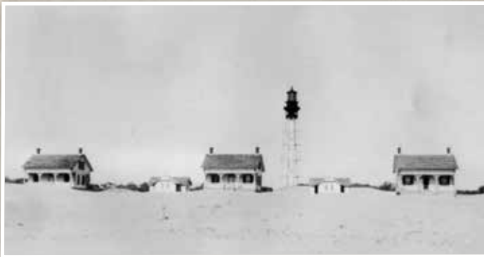
Cape Fear Lighthouse and Cottages.