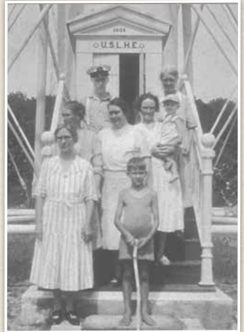
Swan family in front of CFLS Steps.