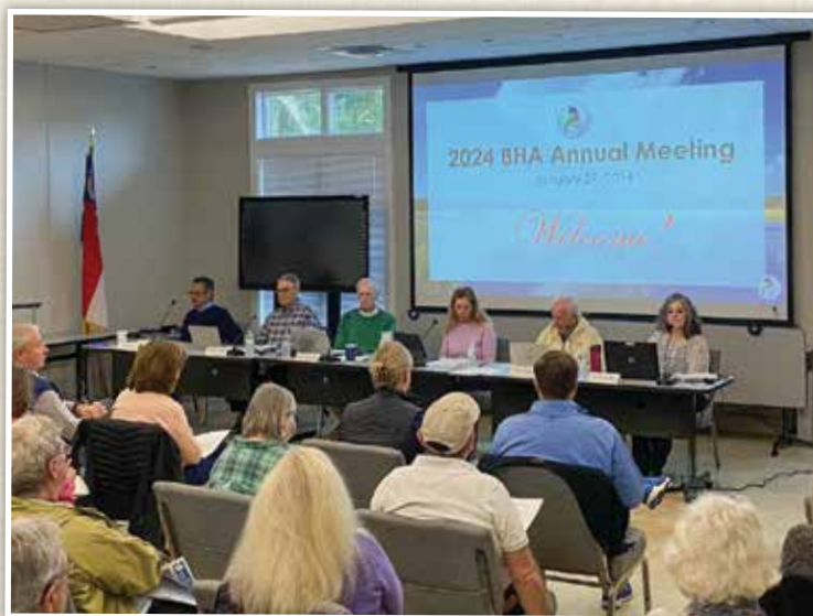
2024 BHA Annual Meeting.