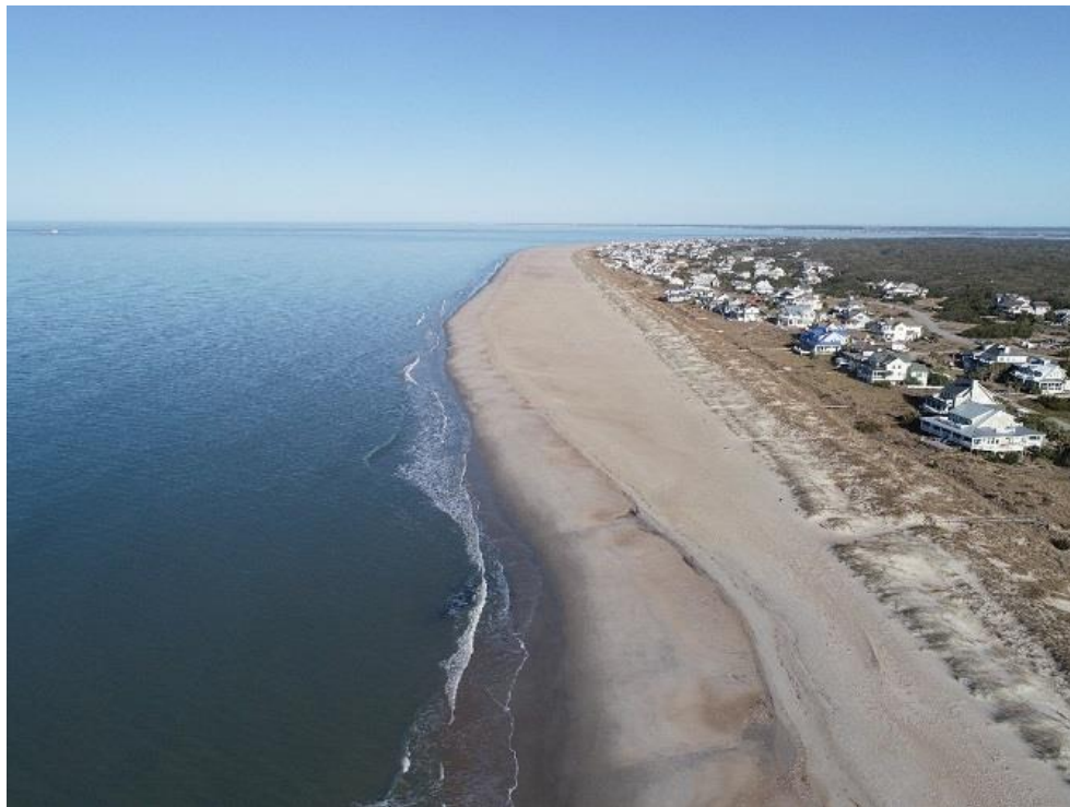
BHI South Beach Project Complete Photo – 15 MAR 2019