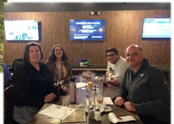
Below: This team are proud winners of our Trivia Night at Barrio Brewing.