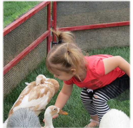
Above: A little resident making friends with the ducks in the petting zoo during the Spring Sp'egg'tacular.

EVERYDAY EVENTS. Building a strong Lifestyle program is about listening to residents. There are so many opportunities to bring people together based on day-to-day conversations. Events are stumbled upon, requested, and inspired by just listening to the voices of our residents and letting the magic happen organically. So if you have an idea, we want to hear it!