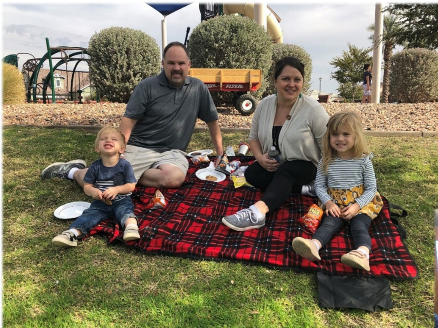
Left: A Cooley Station family enjoys the shade at the Fall Family Picnic.