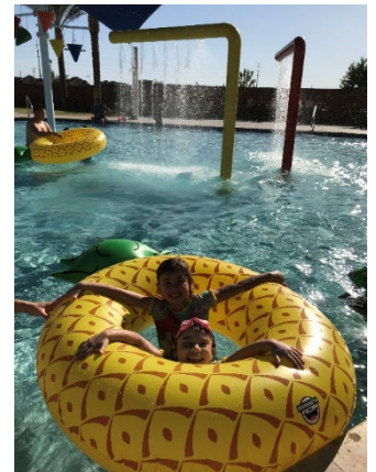
Above: Kids enjoy the new inner tube at the Summer Splash: Party Like a Pineapple.

KEEPING SAFE. Water is shallow; no diving. No running on deck. Do not prop open gates. No roughhousing. No glass is allowed inside pool gates. Parties and large gatherings are not permitted poolside unless it is a community event arranged through the Lifestyle Director. Each household may bring a maximum of two guests to the pool.