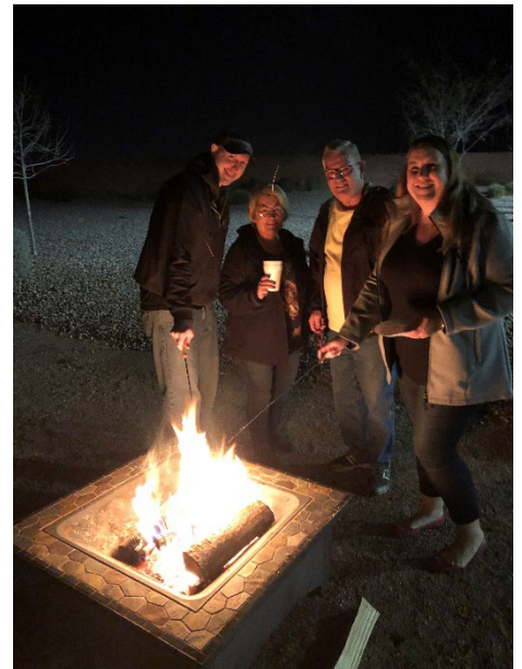
Top: Kids race for goofy prizes at the Fall Family Picnic.

Lifestyle is all about building relationships and finding ways to make it connection happen.