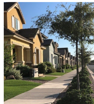
Above: Streetscapes are the area between the sidewalk and the street maintained by the HOA.

The Town of Gilbert picks up trash and recycle containers on Thursdays. Please place your bins at the curb no sooner than 6 p.m. the evening before and store it by 6 a.m. the day after pick-up. Trash and recycle bins should be placed either inside the garage, within a fenced yard, or in a fenced enclosure.