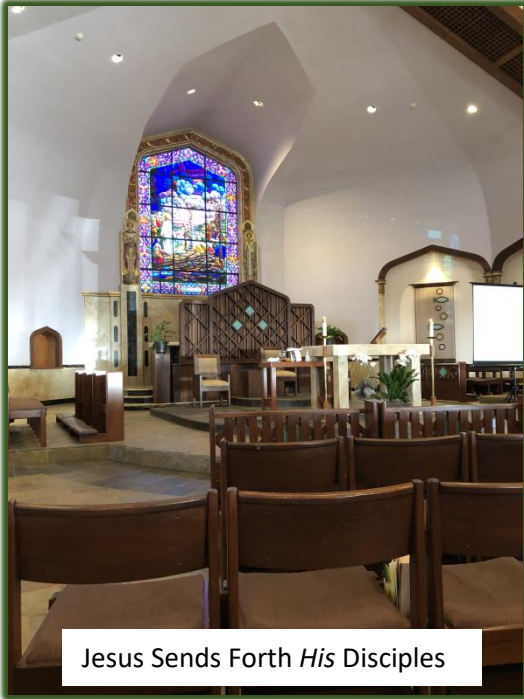
Jesus Sends Forth His Disciples

“Praying for you guys at St. Anthony!” (Saturday Night Mass, September 11)