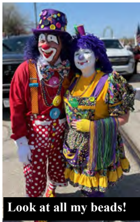
Look at all my beads!

The office of Philanthropy will host a Walk for Love Fundraising event on November 15th. The one-mile walk will begin at the hospital, pass through the historic East End of Galveston, and conclude back at the hospital. Afterward, we will host a carnival in the green space and parking lots behind the hospital, featuring fun activities for kids, including face painting, balloon animals, games and more. The primary goals of this event are to raise awareness of our services in the community, build corporate support, and generate funds for the hospital.