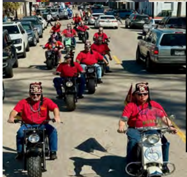
Great way to start the parade