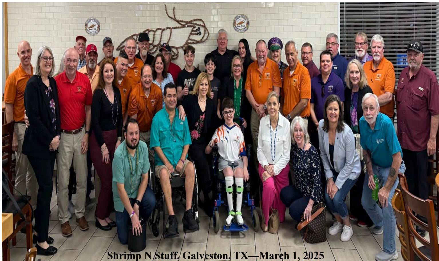
Shrimp N Stuff, Galveston, TX—March 1, 2025