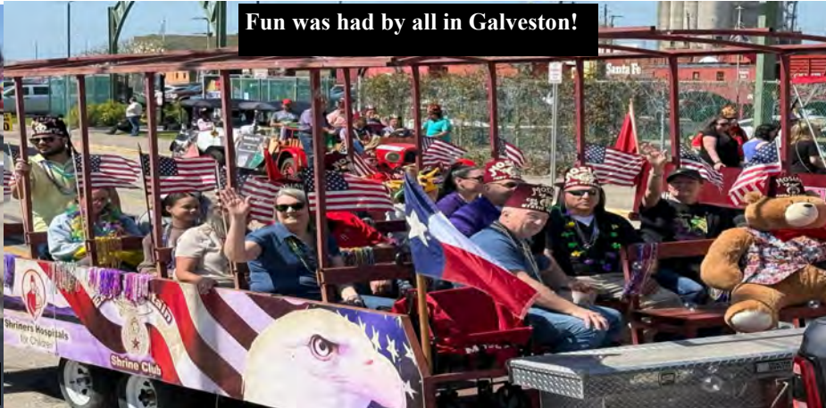
Fun was had by all in Galveston!