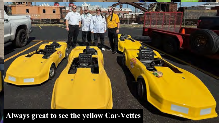
Always great to see the yellow Car-Vettes