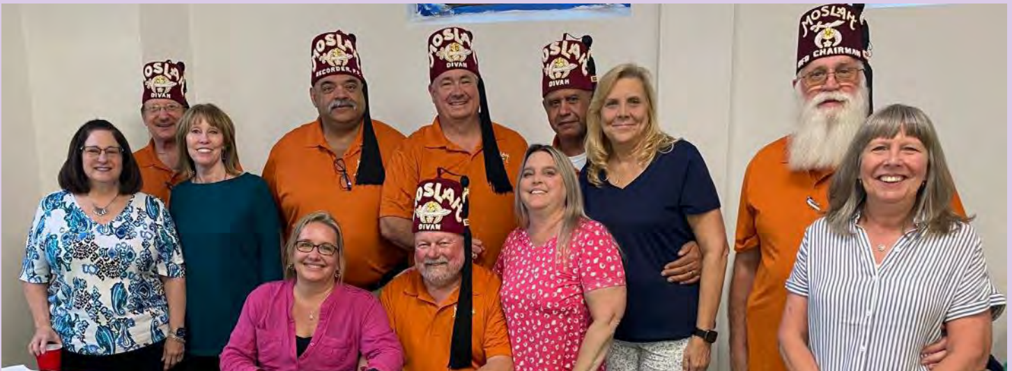
The Divan and Ladies with the HFD "Back Office" count team

September 23 rd – Fall Hospital Fund Drive Street Collections (Cleburne, Granbury, Mineral Wells, Acton) November 18 th – Moslah Christmas Car Show