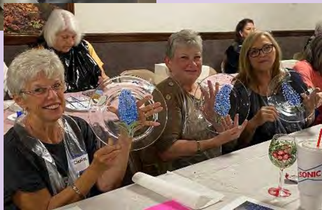
Ladies showing off their works of art!