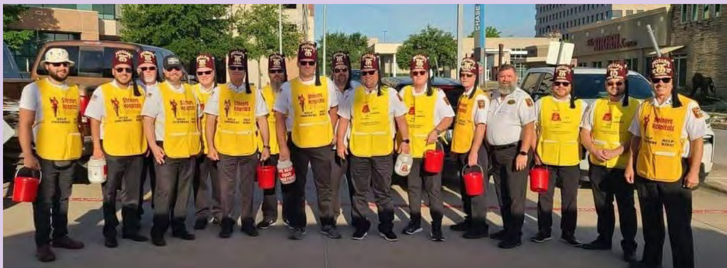
Solid Gold Patrol