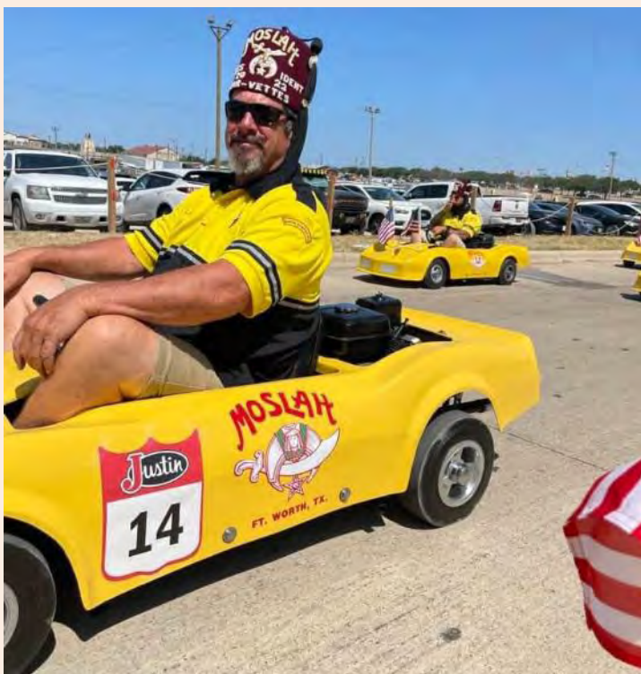
National Day of the Cowboy Parade