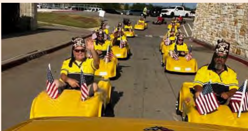
Below – Granbury 4 th of July Parade