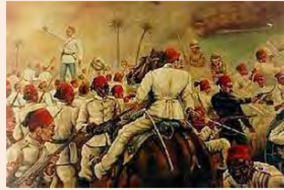
Egyptian Military men were once required to wear the red Fez.