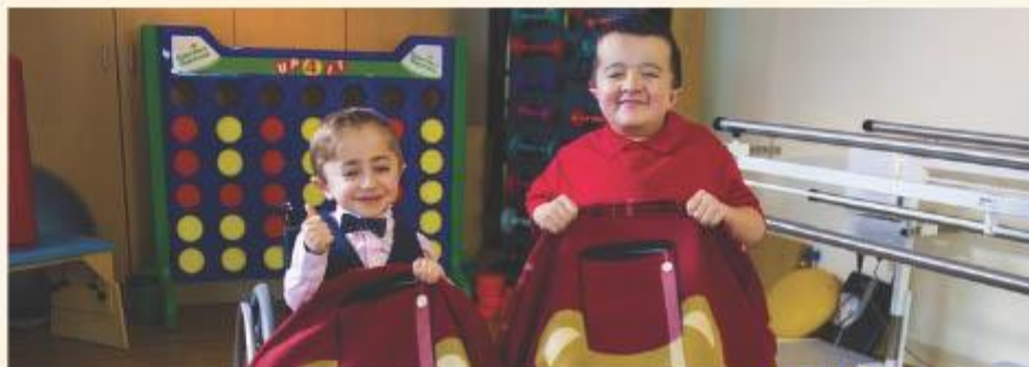
TOUR SHRINERS CHILDREN'S TEXAS HOSPITAL