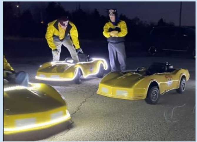
Car-Vettes prepare for Decatur Parade of Lights