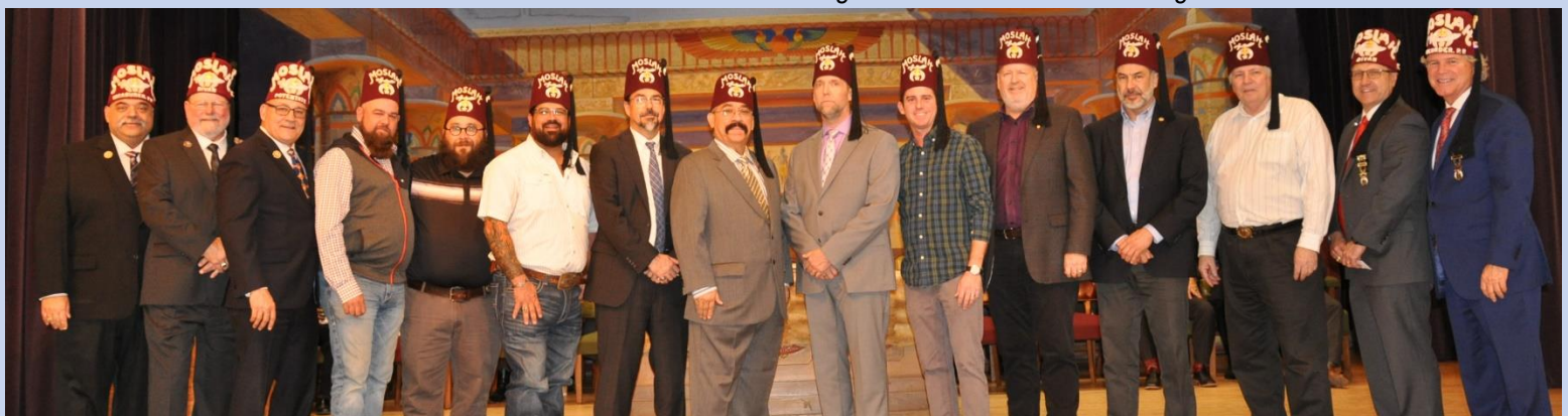
Elected Divan with the new nobles obligated at the business meeting