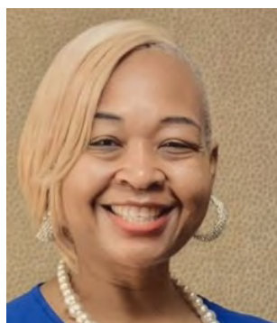
With Tiger Love and Pride

Cheers to all of you for supporting this Scholarship Banquet to help educate our leaders of tomorrow. A million thanks are in order to each and everyone of you for your unselfishness and your commitment to educate our future leaders.