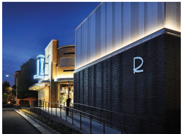
de Leon & Primmer Architecture Workshop

T he Hailey Building demonstrates a general economy of means to achieve maximum effect. The use of glazing and brick work show the strong detailing and materiality of the project. There is a sensitive transformation of the surrounding sidewalks and parking lot to allow for integration of public space and accessibility, thus converting vehicular space into “people” space. The skilled use of site and building lighting activates the space. There is a clear transformation of an earlier insensitive addition to the original Hailey building, creating a stronger contrast of Modern and Art Deco.