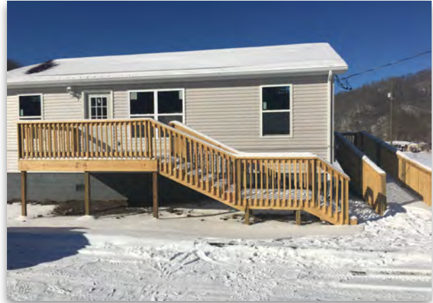
This Richwood home is near completion thanks to voluntary organizations that worked during the winter months to get construction done.