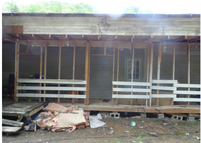
A family of five, including three children, lost their Clay County home in the June 2016 flood. They were living in a camper until Catholic Charities and other WV VOAD agencies helped secure funding for a new mobile home.