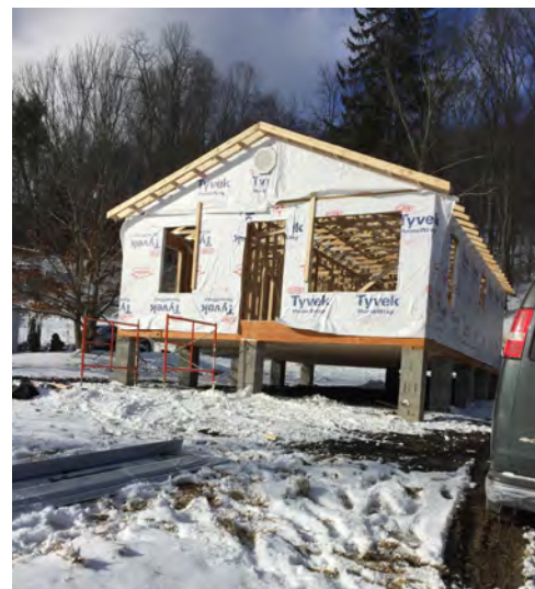
WV VOAD and its member agencies worked throughout the winter months to build this new home for flood survivors in Rainelle.

Continuing the building process over the winter was difficult, but important to help get families back into safe, secure and sanitary housing and get their lives back together as quickly as possible. It took plenty of logistical planning and cooperation between WV VOAD and its member agencies.