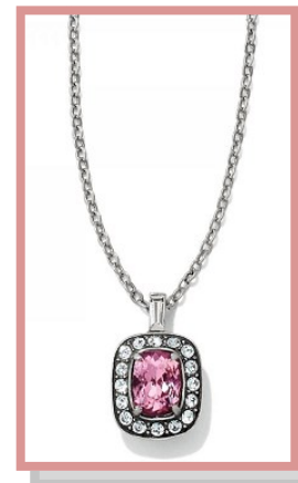
Reina Necklace JL6313|$58