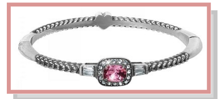
Reina Bracelet JF3363|$78