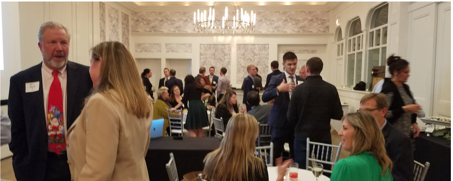
Networking at the 2019 Holiday Party